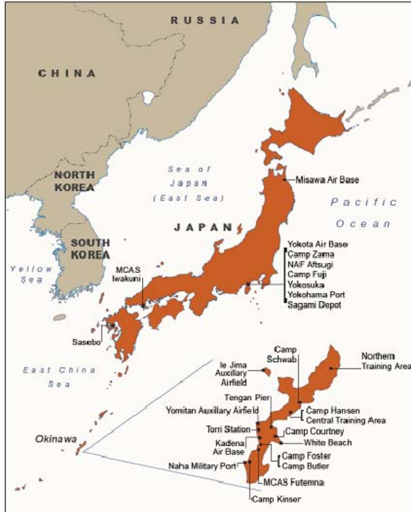
Figure 2. Map of U.S. Military Facilities in Japan