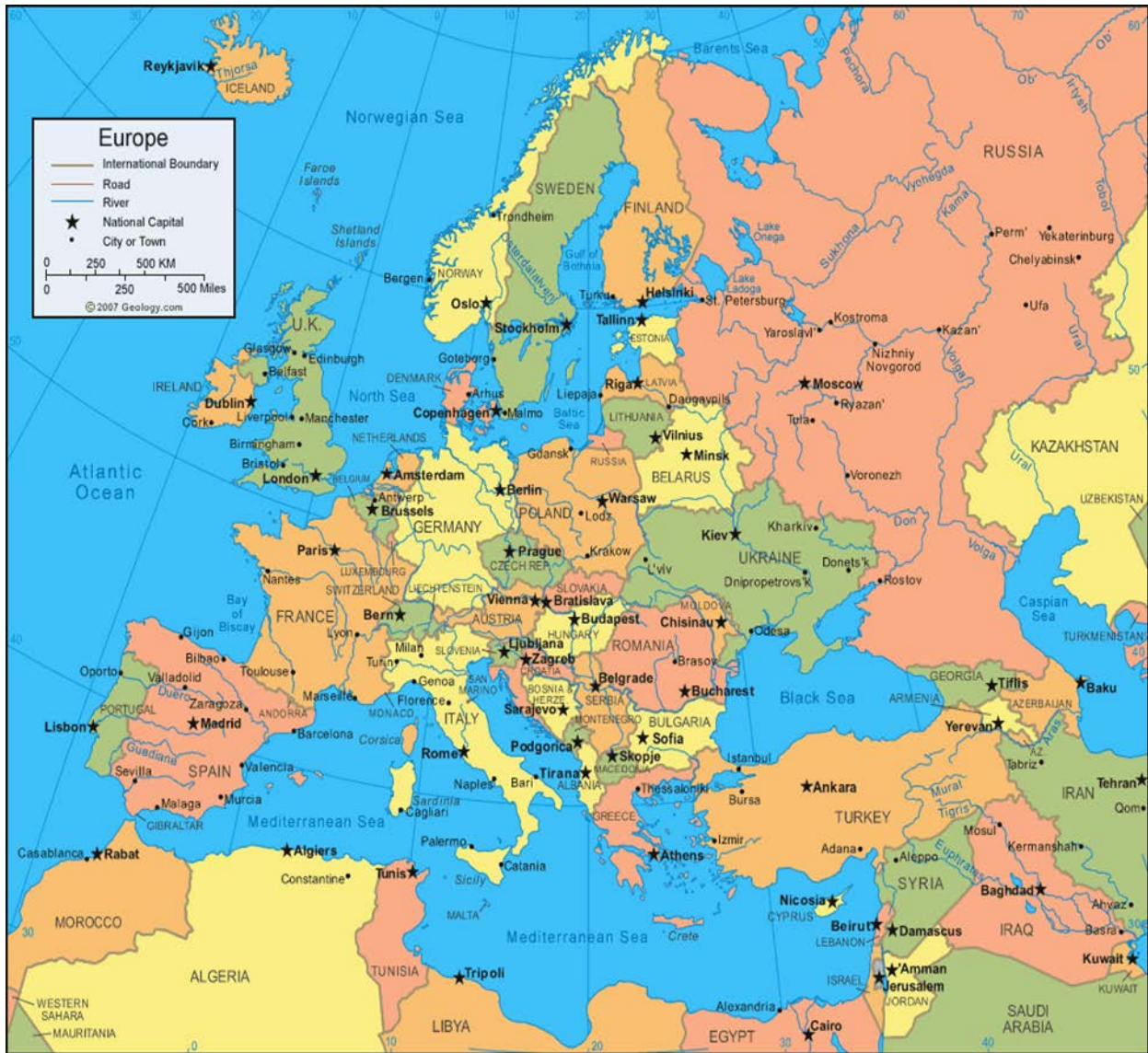
Figure 1. Map of EUCOM AOR (Image from Geology.com, 2007)