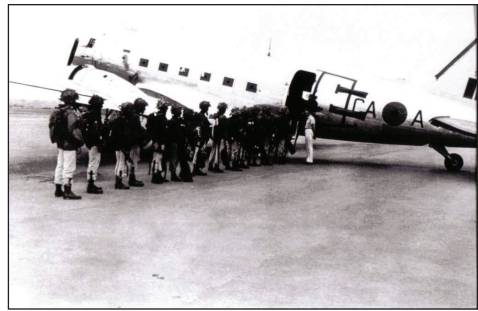
Figure 5. Cdn SAS Coy paratroopers emplaning for a practice jump.

Canadian military leaders quickly realized that cooperation with their closest defense partners would allow the country to benefit from an exchange of information on the latest defense developments and doctrine. For the