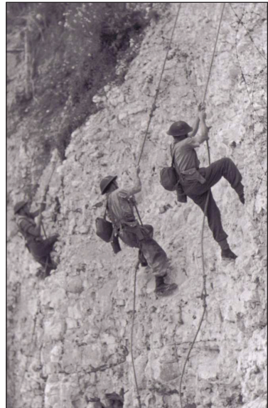
Figure 1. Canadian volunteers undergoing grueling commando training - scaling near vertical cliffs.

The SOE, however, was not the only innovative, unconventional effort. In a remarkable display of military efficiency, by 8 June 1940, two days after Churchill’s directive, General Sir John Dill, the Chief of the Imperial General Staff, received approval