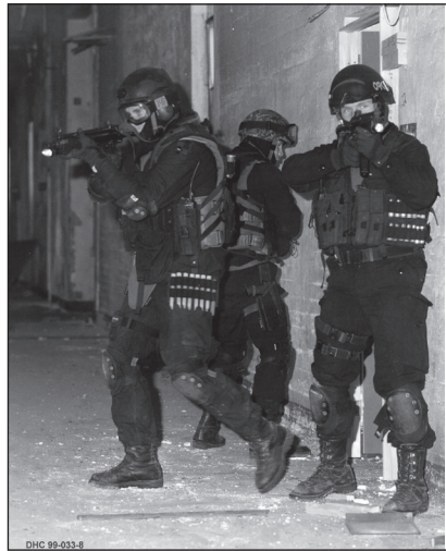
Figure 8. JTF 2 members in their black role practicing a hostage rescue.

Although the unit was expanding to include a green component, as already mentioned, its focus was still almost exclusively on black skills. A "green phase" during initial training was largely an introduction to field-craft for the noncombat arms volunteers. Within the unit there was also