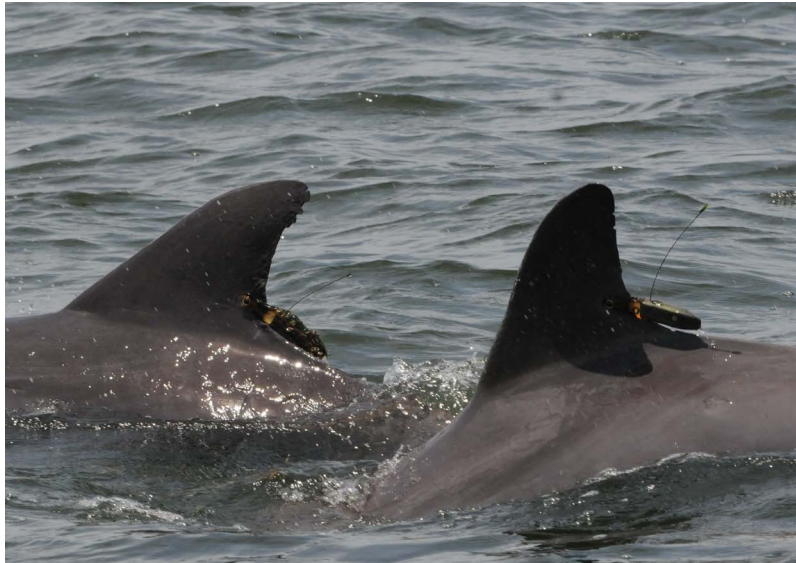
Figure 3. Adult males F164 (left) and F242 (right) 92 days post-deployment, showing heavy biofouling on F164's uncoated tag, and no growth on F242's coated tag.