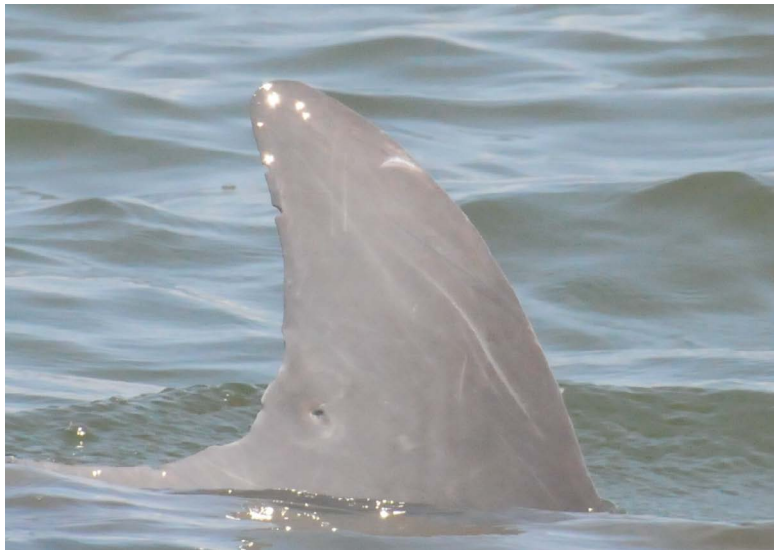
Figure 2. The dorsal fin of adult male F242, 119 days post-deployment. The tag was attached for at least 92 days before coming off the dorsal fin, as designed. The only remaining evidence of tagging is a small hole near the bottom of the fin, with no indication of necrosis. Photo by Sarasota Dolphin Research Program, taken under NMFS Scientific Research Permit No. 15543.