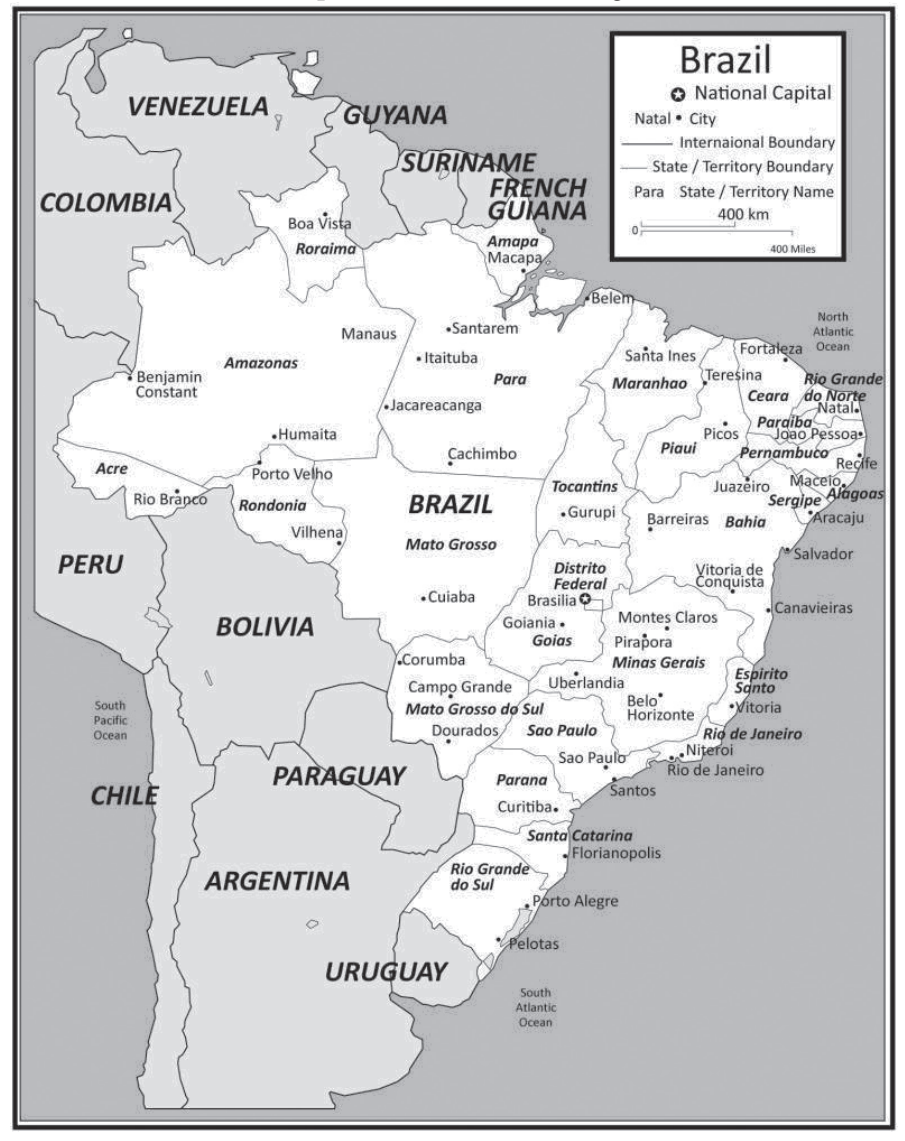
Figure 1 . Map of Brazil. Created by U.S. Special Operations Command Graphics.

countries for a long time. There have been many international pressures on the area, including incursions by foreign powers starting as early as the 16th and 17th centuries. Brazil resisted the threats to its sovereignty in different regions.<sup>5</sup> There are still significant challenges to overcome as Brazil pursues the settlement and development of the Amazon region.