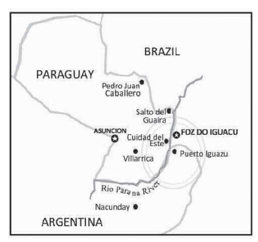
Figure 2 . Tri-Border area map. Created by U.S. Special Operations Command Graphics.

In 2002, after the tragedy of 9/11, Argentina, Brazil, and Paraguay invited the United States to create the "3+1 Counterterrorism Dialogue," a mechanism focused on terrorism prevention, CT policy discussion, information sharing, increased cross-border cooperation, and mutual CT capacity building.