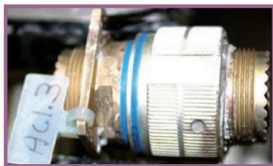
Figure 2. AlumiPlate-coated electrical connector, After 2,000 hours B117 exposure. 12

ings applied through Atmospheric Pressure Chemical Vapor Deposition (APCVD). 9 Environmentally benign CVD processes using triethylaluminum as a precursor for producing high-quality aluminum coatings was explored. While promising, this process involves special high-cost, equipment. Considerable further development from a process standpoint would likely be necessary to implement this process for high-volume applications such as electrical connector shells.