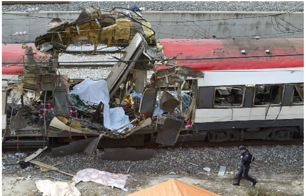
A policeman walks alongside a train that was bombed in Madrid on March 11, 2004.

ON MARCH 11, 2004, a series of coordinated bombings ripped through Madrid's commuter train system, killing 191 people. Although the attacks have been described as the product of an independent cell of self-radicalized individuals only inspired by al-Qa`ida, the extensive criminal proceedings on the Madrid bombings refute this hypothesis. 1 The network responsible for the Madrid attacks evolved from the remnants of an al-Qa`ida cell formed in Spain a decade earlier. It was initiated following instructions from an operative of the Libyan Islamic Fighting Group