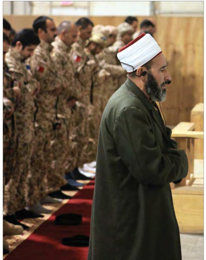
More than 300 Muslims from the militaries of various countries (including Jordan, Bahrain, Bosnia, the United Kingdom, and the U.S.) participate in a service at Camp Leatherneck to celebrate Eid al-Fitar, which marks the end of the holy month of Ramadan.

From "A Guide for Understanding Coalition Cultures"