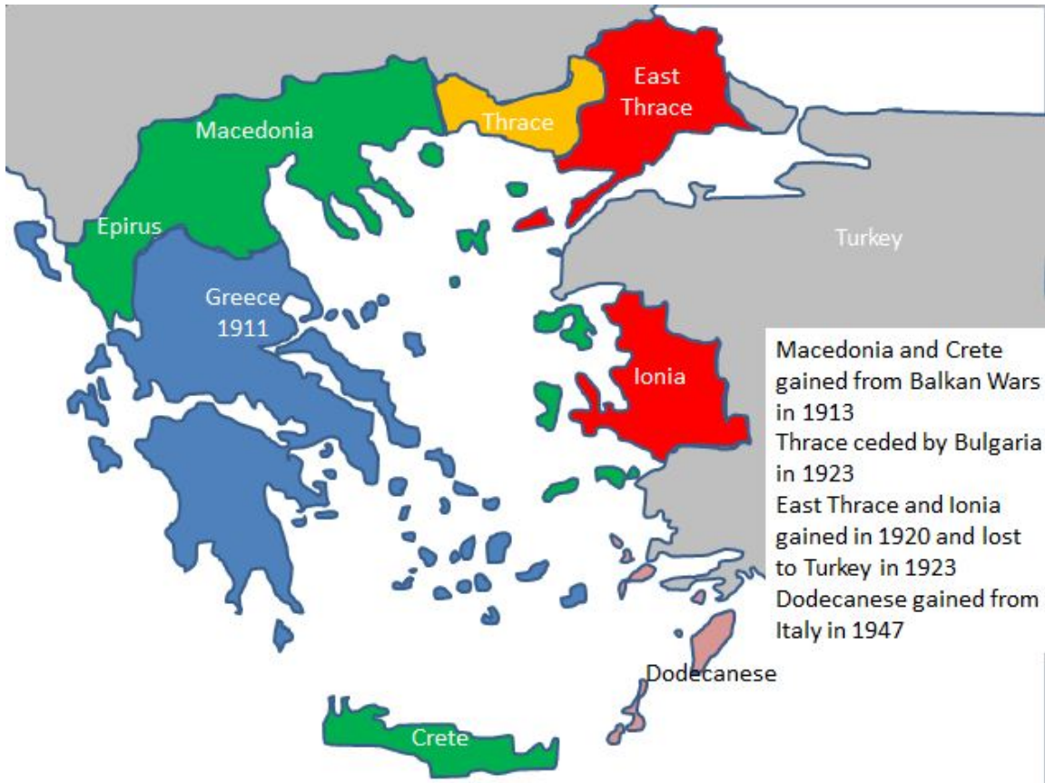
Figure 1. Map of Greek Territorial Expansion

Venizelos parties in 1936. This division would also provide a central cleavage for the Civil War. 24