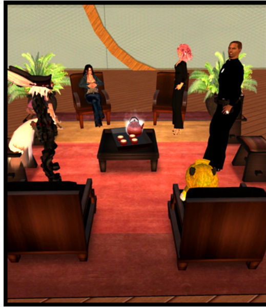
Figure 1: A Group Discussion in Second Life Begins

activities in-world. The observation method was also used throughout the entire study, and was valuable for discovering many unexpected behaviors.