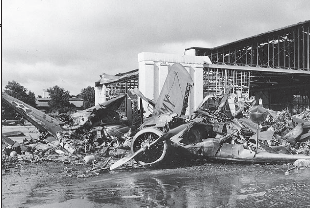
The 804th Aviation Engineer Battalion cleaned up the wreckage caused by the Japanese bombing of Wheeler Field when Pearl Harbor was attacked on 7 December 1941.

weapon. He hurried to Schofield Barracks, where the battalion commander gave him back Alpha Company. He found his men in the street, shooting at attacking planes, and told the supply sergeant to give weapons to anyone who asked for them and to tell them to shoot at the Japanese planes. Later, the lieutenant almost had to pay for the weapons, because in the haste to go to war, no one had asked for—or given out—receipts!