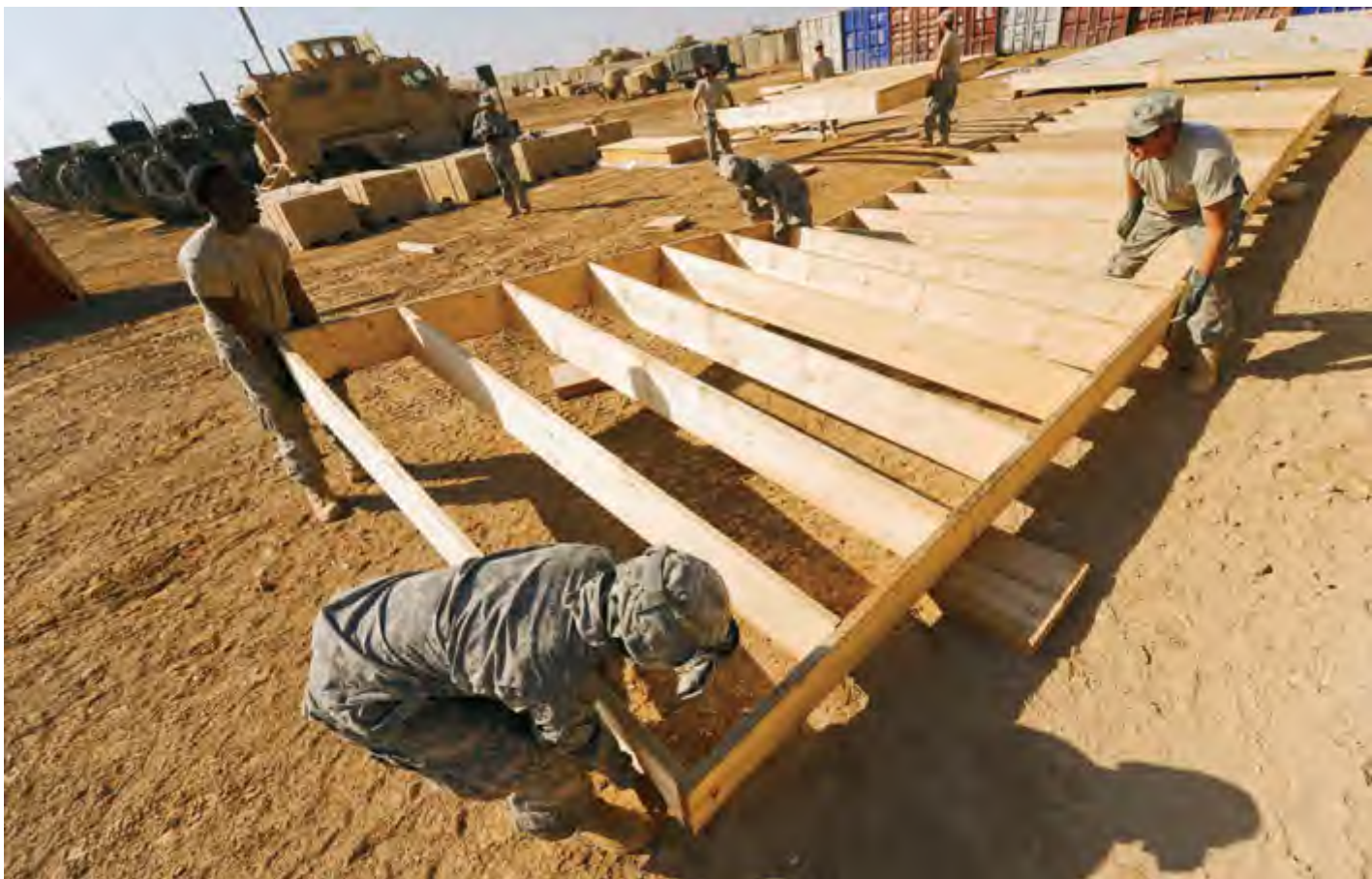
Soldiers work on a construction project at Forward Operating Base Price, in Helmand province, Afghanistan. The Defense Supply Center Philadelphia is sourcing the lumber builders need to keep pace with the increasing number of construction projects in country.