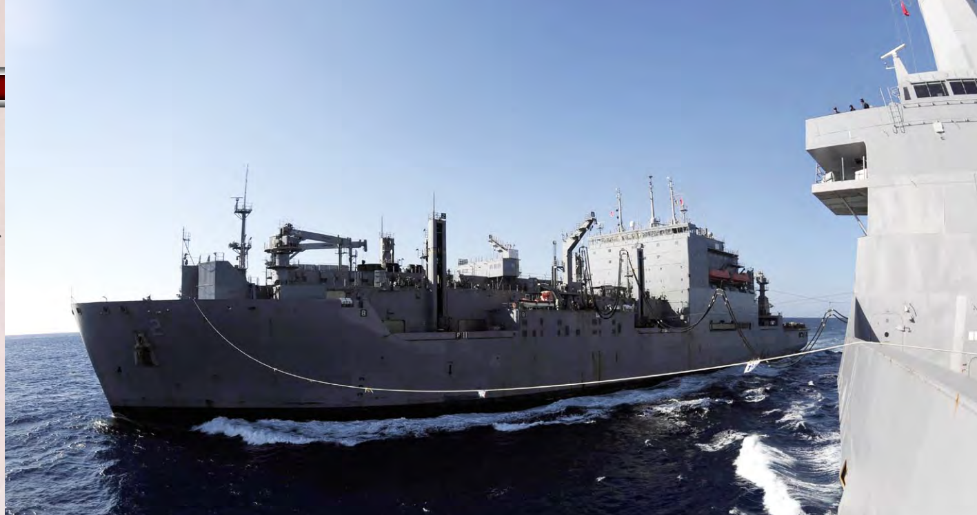
The Military Sealift Command dry cargo and ammunition ship USNS Sacagawea (left) and the amphibious transport dock ship USS Mesa Verde conduct an underway replenishment in the Mediterranean Sea during Operation Unified Protector. DLA Energy provided 209 million gallons of fuel products to U.S. forces during the operation.