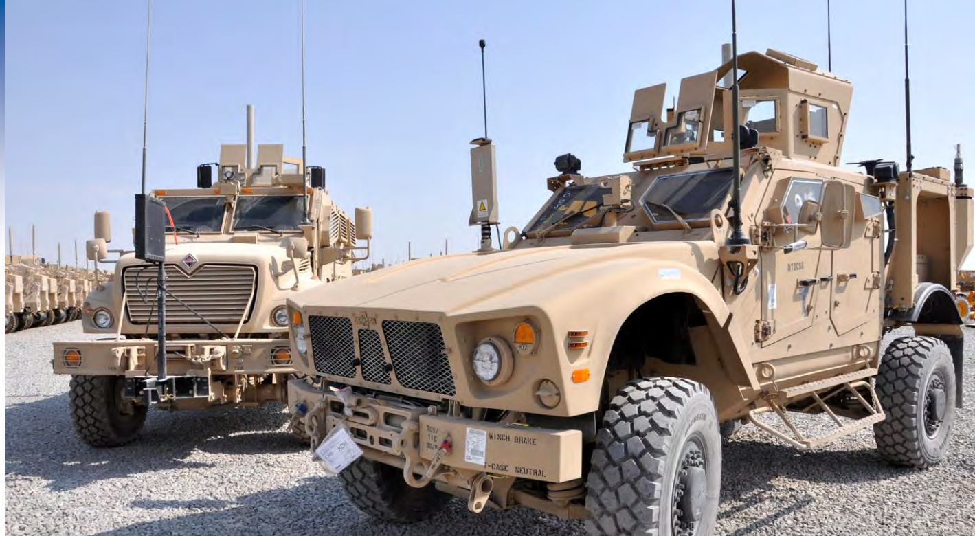
Mine Resistant Ambush Protected vehicles await pickup in Kandahar, Afghanistan. The Office of Internal Review at DLA Land and Maritime helped ensure the more than $1.4 billion in MRAP funding the primary-level field activity handles was managed well.

more than $1.4 billion in funds from the military services for Mine Resistant Ambush Protected vehicles, he turned to his Office of Internal Review.