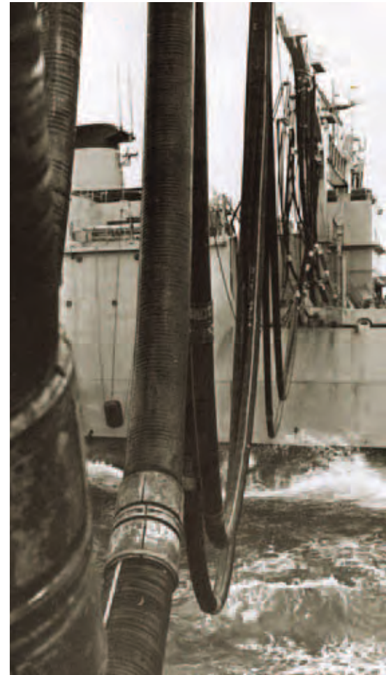
Fuel hoses connect two ship conducting a refueling at sea.