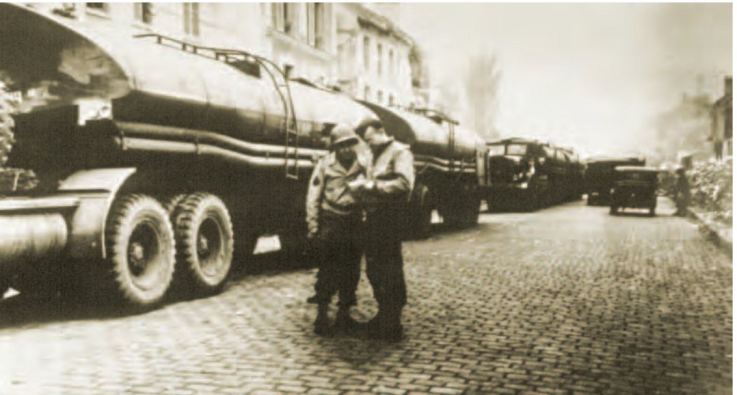
Soldiers in World War II prepare for a fuel convoy. The Army-Navy Petroleum Board, DLA Energy's earliest incarnation, managed petroleum during the war.

DLA was designated the executive agent for bulk petroleum in August 2004, and DESC took on responsibility for the management of all DoD bulk petroleum, with an emphasis on improving efficiency and minimizing duplication and redun-