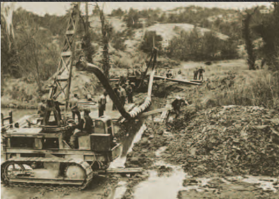
Workers lay pipeline for the movement of petroleum.