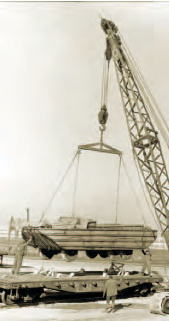
Crane operators off-load supplies in 1943 at the Columbus Quartermaster Depot. Employing more than 10,000 employees, the installation became the largest joint military supply installation in the world during World War II.

all-time high, and that's amazing when you factor in the vast number of weapon systems and service requirements we're supporting in some of the most challenging logistical arenas in the world. DLA Land and Maritime is meeting and often exceeding the expectations of our military forces."