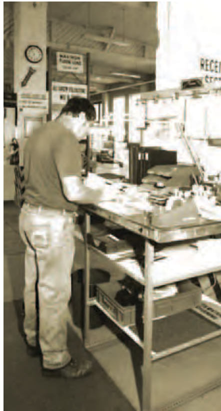
An employee at Defense Reutilization and Marketing Office Berlin works at a receiving desk that saw items totaling an average of $500,000 added to the inventory each month in the 1980s.

The 2010 We Are DLA campaign gave DRMS its new name — DLA Disposition Services — which carries on the original DPDS mission in many ways.