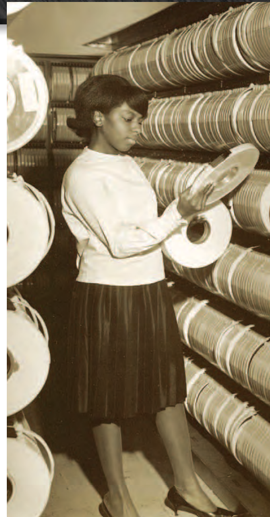
A Defense General Supply Center team member searches for a reel tape for one of the Defense Supply Agency’s earliest computers.

“Nothing touched systemically,” she said. “We were an inventory control point with general supply items.”