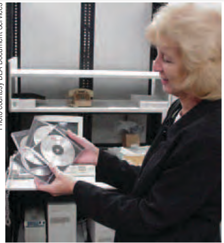
A DLA Document Services team member displays CDs that hold information from Navy aperture cards, which were older data storage systems converted by DLA Document Services.

production facilities located with its customers on U.S. military installations worldwide and at specific government locations, including the Pentagon and the White House. It provides a full portfolio of document services, ranging from traditional offset printing to online documents. DLA Document Services is also recognized as a transformation agent actively moving DoD toward the use of online documents and services.