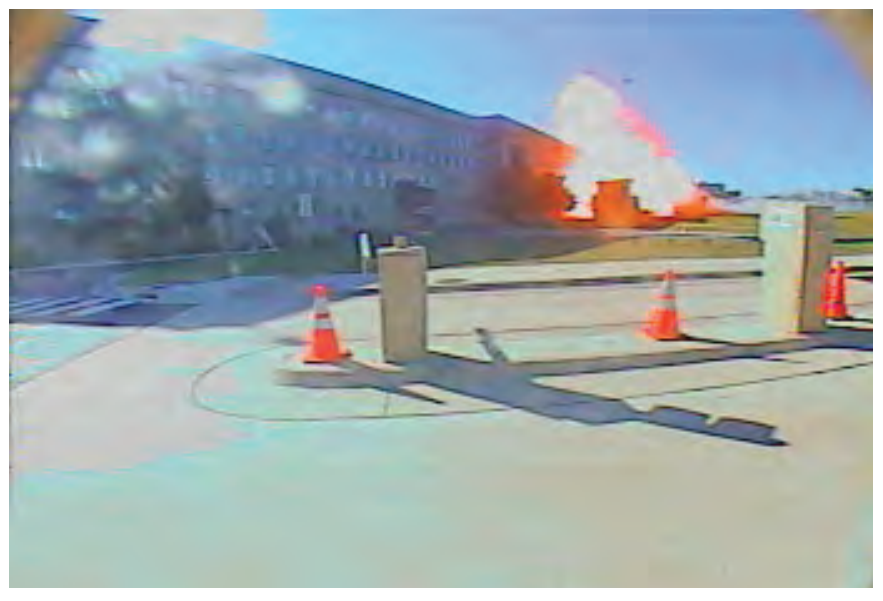
An image of the crash of American Airlines Flight 77 into the Pentagon, captured by a facility security camera.