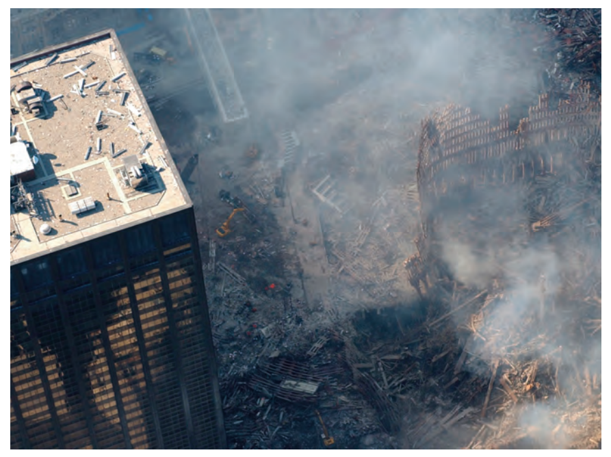
Rubble at Ground Zero, September 19, 2001, one week after al Qaeda terrorists flew American Airlines Flight 11 and United Airlines Flight 175 into the World Trade Center towers, causing their collapse.

The Pentagon in flames, minutes after the crash of American Airlines Flight 77. Foam residue is visible on the building's facade, before its collapse.