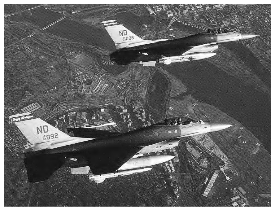
F–16s of the 119th Fighter Wing, North Dakota Air National Guard, flying a combat air patrol over the Pentagon and Washington, D.C., as part of Operation Noble Eagle, November 2001.