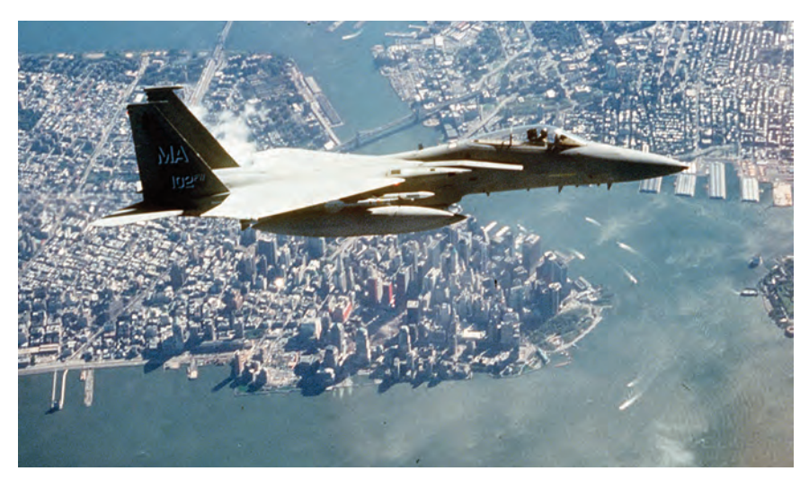
An F–15 of the 102d Fighter Wing, Massachusetts Air National Guard, flying over lower Manhattan and Ground Zero during an Operation Noble Eagle combat air patrol mission several months after the 9/11 attacks.