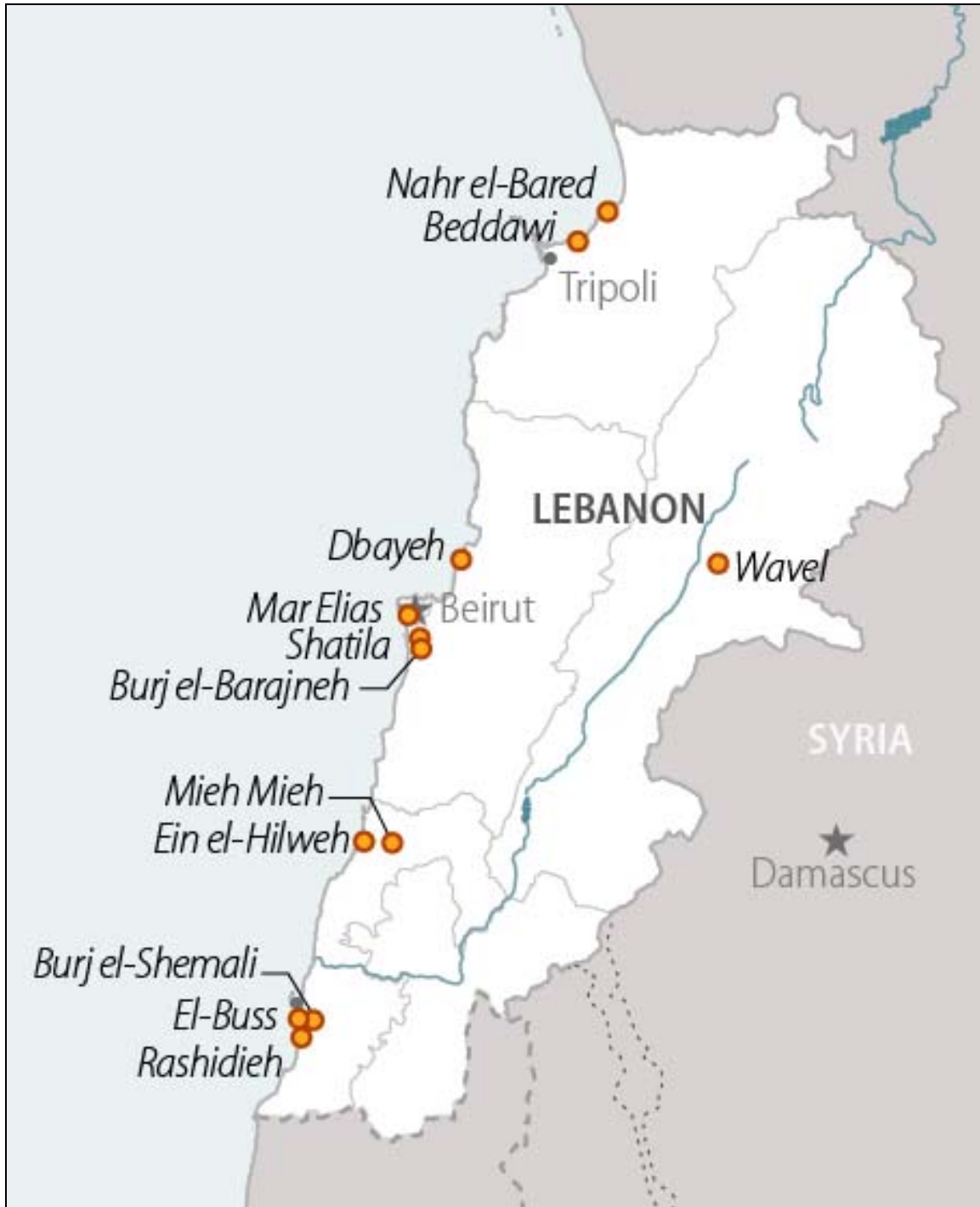
Figure 4. Location of Palestinian Refugee Camps in Lebanon