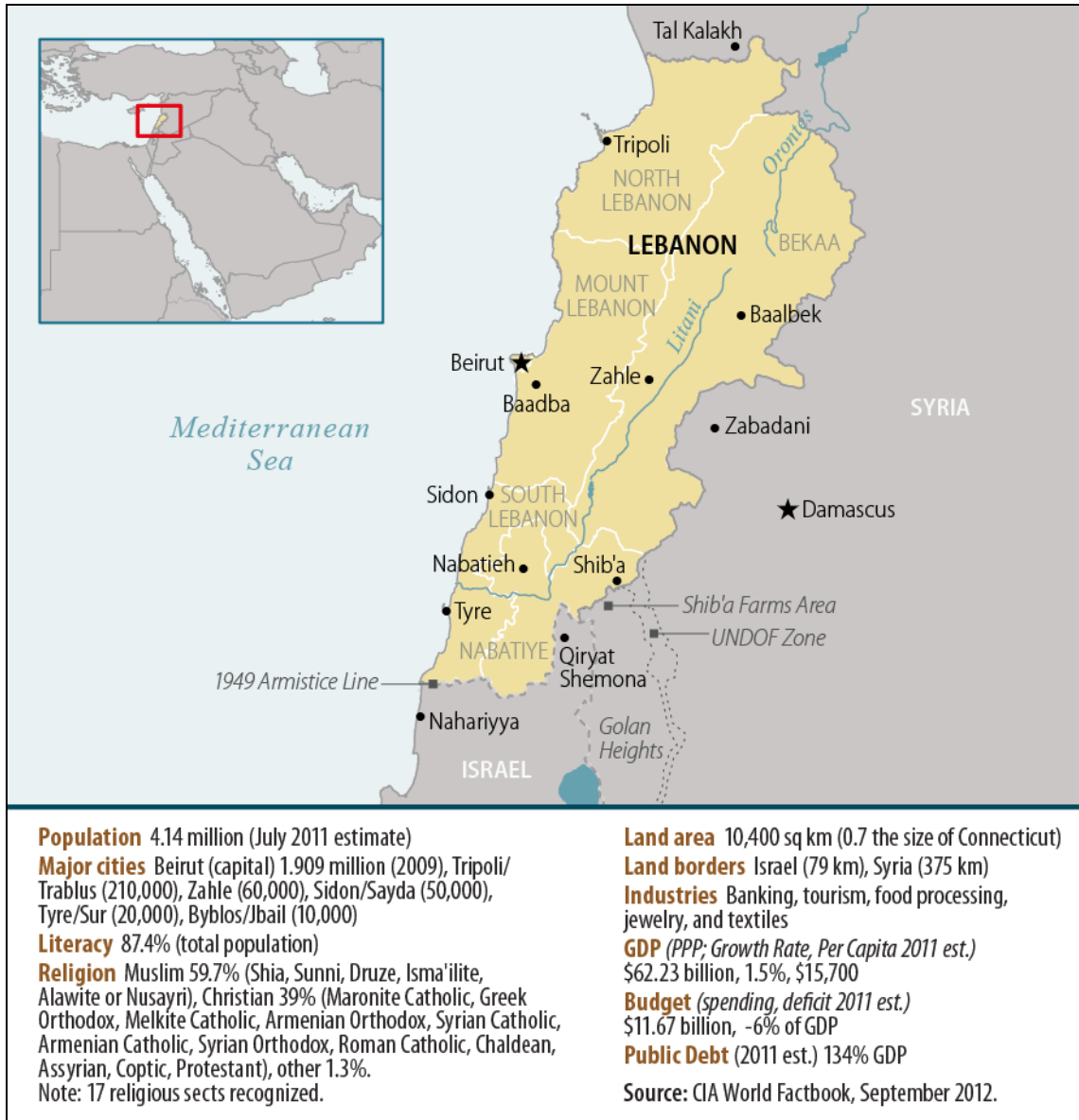
Figure I. Lebanon at a Glance