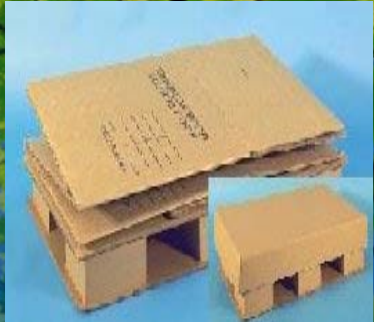
Recycled Corrugated Pallets

Buying Green Products from Defense Supply Center Philadelphia