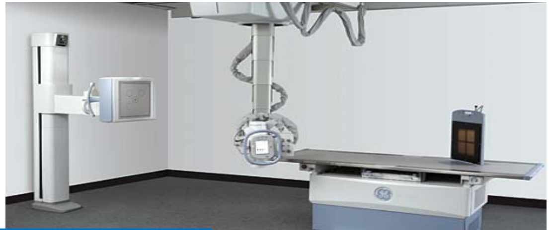
Digital X-Ray System