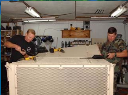
Energy Saving HVAC