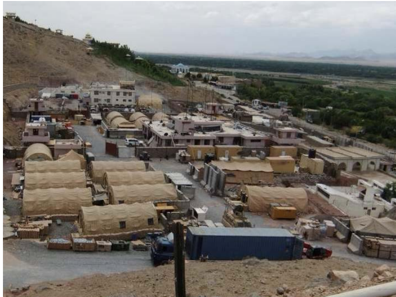
A U.S. Forward Operating Base in the Arghandab River Valley, Kandahar Province, Afghanistan, August 2010, prior to the 2010 Federal election. Because of technology, personnel assigned to this combat outpost could get absentee voting assistance through Federal Voting Assistance Program websites.

Voting Assistance Programs – The Uniformed and Overseas Citizens Absentee Voting Act (UOCAVA [P.L. 99-410], August 28, 1986), as amended and subsequently modified by the Military and Overseas Voter Empowerment (MOVE) Act (P.L. 111-84, Title V, Subtitle H) on October 28, 2009, specified that the right to vote was fundamental. The law explained that many logistical, geographical, operational, and environmental barriers restricted the ability to vote for military and other eligible overseas citizens. Accordingly, the law established various programs and requirements intended to help military and eligible overseas citizens register, vote, and have their votes counted. The law impacted numerous federal agencies, including the: