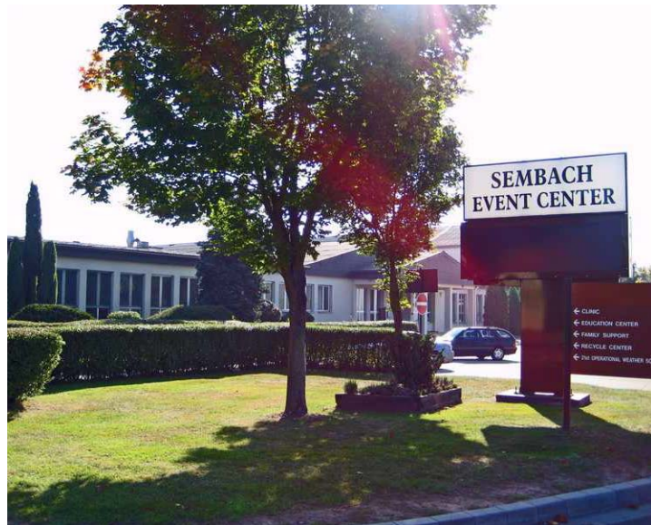
Sembach Kaserne, formerly Sembach Air Base, is a separate installation located in the Kaiserslautern, Germany region and is approximately 16 miles and 30 minutes from Ramstein Air Base. Sembach is currently assigned to U.S. Army Garrison Kaiserslautern and does not have a separate IVAO.