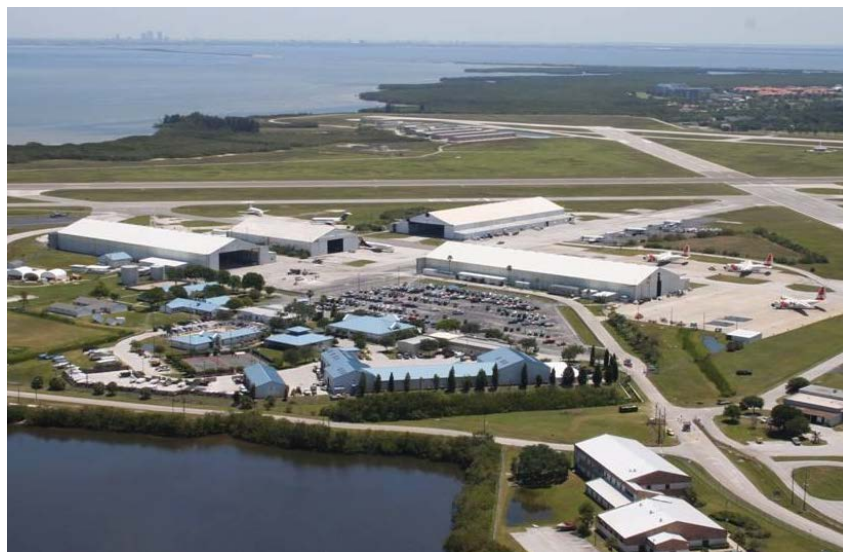
Air Station Clearwater ( Florida) is the Coast Guard’s largest air station, supporting C-130 and H-60 Aircraft. It has an exchange, medical clinic, and other support services for hundreds of Coast Guard personnel. However, it does not have an IVAO and was not included on the FVAP’s universal requirement list.

The FVAP September 2011 report carefully stipulated that because Coast Guard stations were small and geographically dispersed, all stations did not have IVAOs, and instead, relied on voting assistance officers supervised by their Headquarters in Washington DC, or their Personnel Service Center in Arlington, Virginia. The report stated Coast Guard officials were trying to develop criteria to determine when a Coast Guard station should be designated an