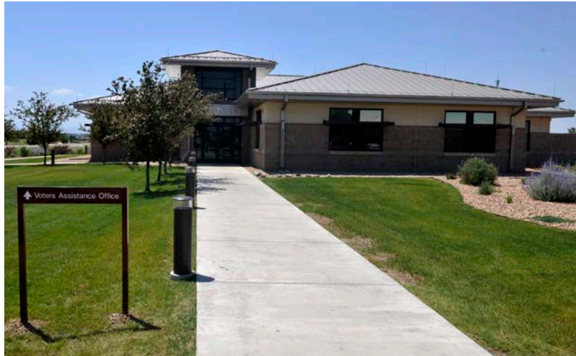
The MOVE Act envisioned a physical facility on every military installation worldwide. The facility was to offer robust, walk-in, face-to-face help to absentee voters. Buckley Air Force Base IVAO, Aurora, Colorado.

One of the most significant provisions of the MOVE Act was for the Military Services to establish an installation voting assistance office (IVAO) on every installation under their control (except for installations in a warzone). The law envisioned an extensive system of IVAOs offering walk-in, face-to-face voting assistance to military members, families, and overseas citizens. The law required the Services to actively inform voters of what help was available—and the time, location, and manner in which they might get that help.