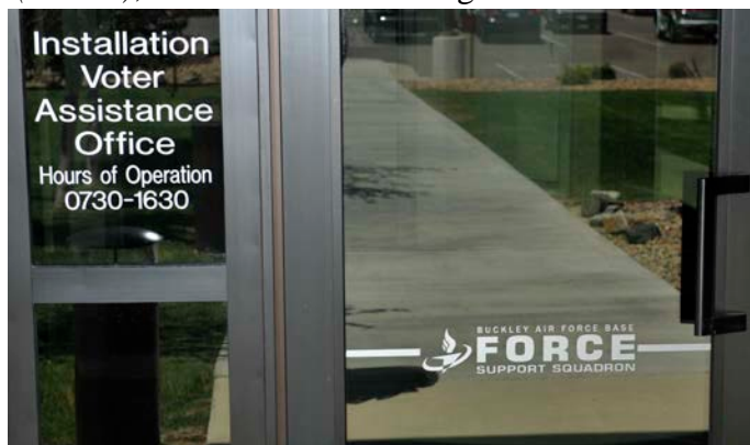
The FVAP Installation Voting Assistance Office Handbook required that Installation Commanders post the time assistance was available to absentee voters. Buckley Air Force Base IVAO, Aurora, Colorado.

On November 15, 2010, the Under Secretary of Defense for Personnel and Readiness issued Directive-Type Memorandum (DTM) 10-021, Guidance in Implementing Installation Voter Assistance Offices (IVAOs) , and the Federal Voting Assistance Program (FVAP) Office subsequently published an Installation Voter Assistance Office Handbook (undated). Collectively the publications reiterated the requirement to establish an IVAO on every military installation worldwide and emphasized that the intent was to provide “robust” assistance to military personnel, dependents, and overseas citizens. Collectively the publications specified that IVAOs would: