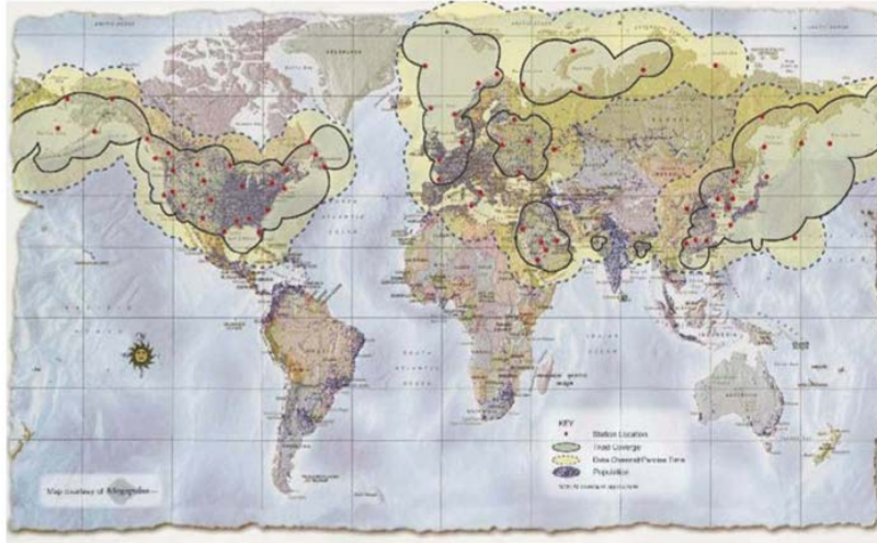
Figure 1. Worldwide Coverage Areas by the Enhanced Long Range Navigation System