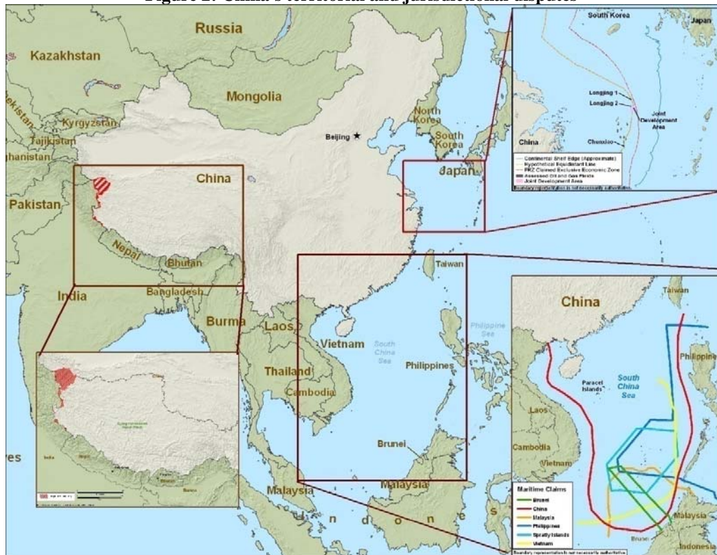
Figure 2: China's territorial and jurisdictional disputes b

Alternatively, China could choose to concentrate on simply securing access to resources and markets against threats from piracy, terrorism, or unstable states, without pursuing territorial claims. Such a choice could lead to conflict with other nations, but it would not necessarily do so. Alternatively, it could provide opportunities for cooperation between China, the United States, and other Asian nations—for example, for joint development of natural resources or joint military patrols of SLOCs.