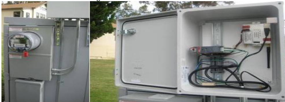
Figure. Advanced Electrical Meter Installation at Building 215 of Naval Base Point Loma

The AMI system is comprised of a meter (electric, gas, water, or steam), communication, and meter data management. The meter has multiple communication protocols, two-way communication that has wired or wireless Ethernet accessibility, and data acquisition system to capture and retrieve metering data. The AMI system records customers' energy consumption; collects metering data in 15-minute intervals; retrieves electric, gas, water, and steam meters' data at least every 4 hours; and transports the information back to a centralized data repository. The figure below shows a picture of the advanced electrical meter installation at Naval Base Point Loma, California.