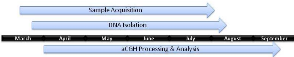
Figure 3. Revised timeline for rapid acquisition and processing of samples for aCGH. A system of regular weekly case review and archived block retrieval has been established with the Department of Pathology and will commence in mid-March. As each set of blocks is obtained and the regions of tumor are identified from the H&E slide, core punches will be obtained and DNA will be isolated. As batches of DNA are isolated, they will be placed into a weekly queue for aCGH sample preparation and array hybridization. Each batch of 12 aCGH samples will then be able to be assessed for ZNF217 20q13 amplification, and the cases will be passed on to the immunohistochemistry group. We anticipate that by early September, the 100 amplification-positive cases and 50 amplification-negative samples have been identified by aCGH. Further analysis of all the screened cases will be performed using Genomics Workbench (Agilent) during September.