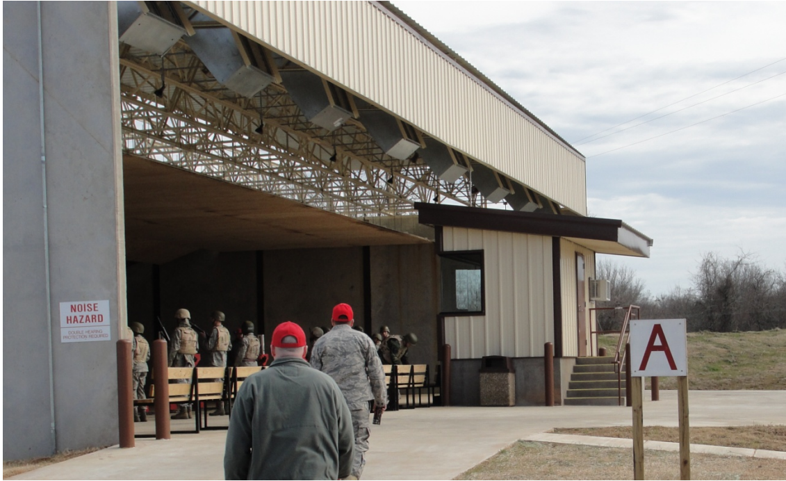
Figure 3. Open area behind shooters

b. The linear sound pressure level decay rates, in decibels per second, were computed by selecting the linear decay phase of each time history and performing a sound level versus time analysis through the decay phase. The slope of this curve is the decay rate.