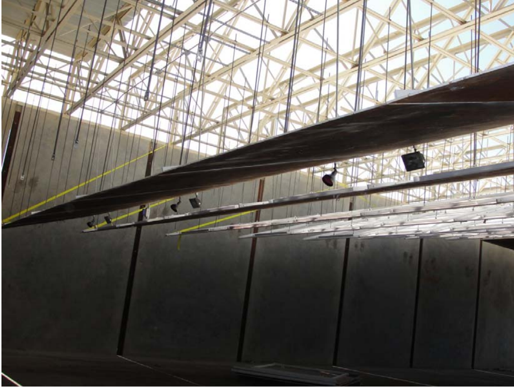
Figure 2. Side wall and overhead containment baffles

b. The range does not have a back wall behind the shooters as they face the bullet trap. The absence of a back wall creates a large opening through which acoustic energy can escape the range (see Figure 3). There is a control tower at the center of the opening that reflects acoustical energy back into the range.