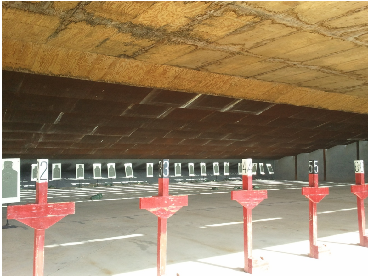
Figure 1. Down-range view of Barksdale CATM Range A

a. The Barksdale CATM Range A is a partially contained range with 21 firing stations used for M4 and M9 training (see Figure 1). A reverberant field occurs when firing as energy is reflected among the ceiling, walls, and floor surfaces, causing the noise to linger at high levels. These noise levels diminish slowly compared with free field conditions (i.e., outdoors, or indoors with acoustical absorption on the interior surfaces). Down-range of the firing line is a series of steel safety baffles on the ceiling that are designed to deflect stray bullets and prevent the bullets from leaving the range (see Figure 2). These panels are closely spaced and reflect acoustical energy, contributing to the lingering noise levels.