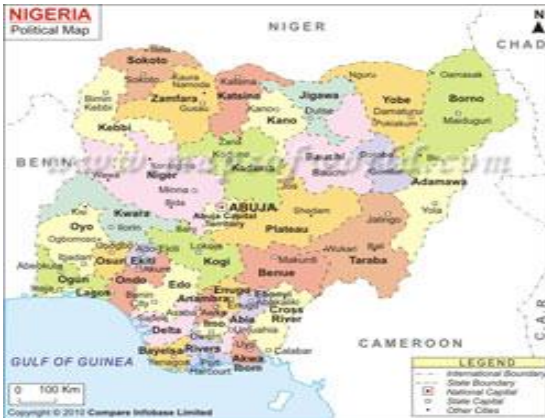
Figure 1. MAP OF NIGERIA BY STATE