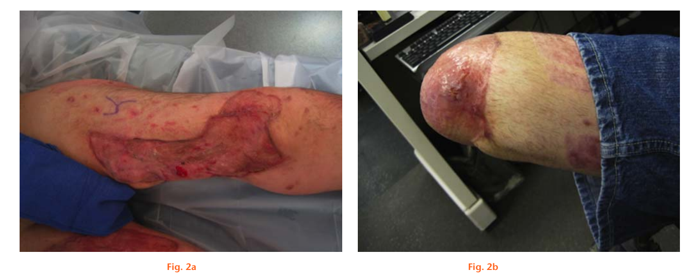
Figure 2a – pre-operative photograph of a medial thigh ulceration in a limb salvage patient with heterotopic ossification (HO) enveloping his femoral vessels and causing secondary knee arthrofibrosis. Figure 2b – clinical photograph of HO ulcerating through the distal aspect of a long transfemoral amputation. Note the skin graft over the terminal portion of the residual limb. Although we advocate avoiding terminal skin grafting of residual limbs whenever practicable, due to the limited available soft-tissue envelope, we are sometimes forced to cover portions of residual limbs with split thickness grafts. Unfortunately, this patient failed conservative therapy and required eventual surgical excision with concomitant resection of the overlying skin graft.

effects, limitations, and complicating factors that make these current prophylactic measures unsuitable for carte blanche utilisation following combat-related injuries.