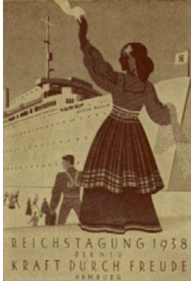
Figure 9. Strength Through Joy