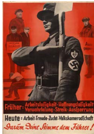
Figure 8. 1936 Referendum Poster

WWI a significant blow to their national identity, but the additional burden of their military being stripped down to 100,000 men and no armaments was devastating. Although Hitler was anti-election, he was creative in using referendums to give the appearance of legitimacy before the people. The poster below was a common sight encouraging the German people to vote for the referendum. The text on the poster reads: “Before: Unemployment, hopelessness, desolation, strikes, lockouts. Today: Work, joy, discipline, camaraderie. Give the Führer your vote!” 38