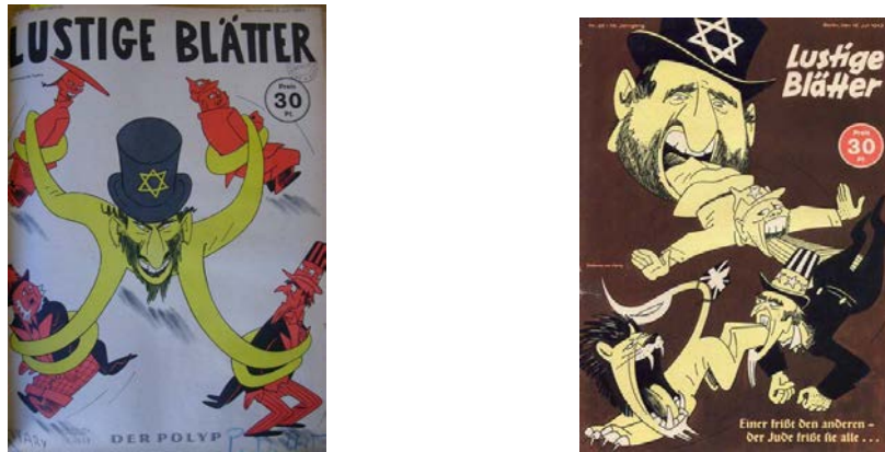
Figure 3. Lustige Blätter Magazine Covers