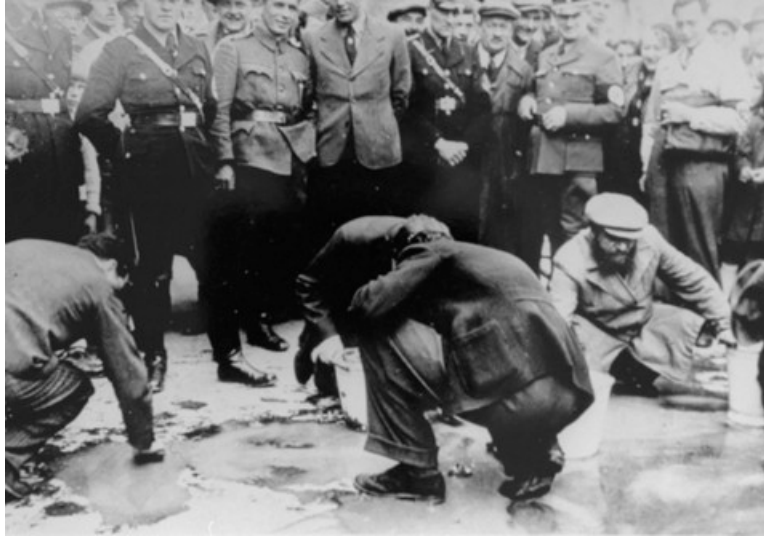
Figure 12. Ausrian Jews Scrub Pavement