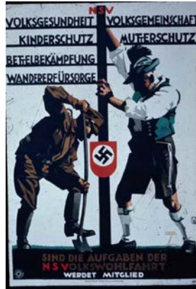
Figure 7. NSV Propaganda

community, helping mothers: These are the tasks of the National Socialist People's Charity. Become a member!" 37