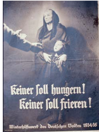
Figure 5. Winter Aid ( Winterhilfswerk )