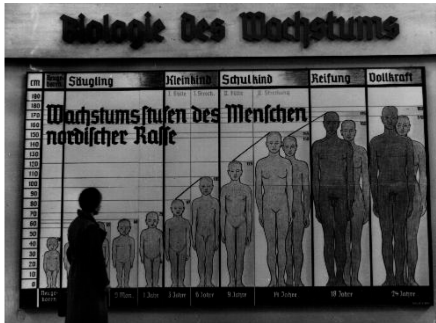
Figure 11. The Biology of Growth

Nazism pursued a racial purity standard with the Germanic or Aryan race at the top of the hierarchy followed by subclasses of humans. The only people—other than Germans—acceptable to Nazi ideology were people of Nordic race. These people were said to be blond or brown haired, with light colored eyes, fair complexion, relatively tall in stature and predominately found in northern European lands.