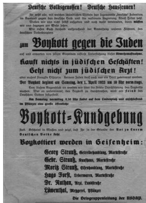
Figure 1. Anti-Jews Boycott Poster

no. 88., on 1 April 1933. 18 It announced the planned boycott of all Jewish stores, goods and services such as legal and medical services provided by Jewish professionals. The goal of this program was the elimination of Jewish businesses and their interaction with the German public. On 1 April 1933, posters such as the one below announced the boycott in the towns throughout Germany. This poster was posted in the town of Geisenheim announcing the boycott.