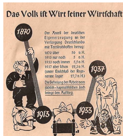
Figure 2. The People is Master of its Economy

To assist in polarizing the nation, the Nazi Propaganda Ministry took every opportunity to highlight to the German people the Reich's accomplishments and how it intended to restore the economy, while simultaneously dehumanizing and vilifying Jews. The below article is from " Die Wirtschaftspolitische " dated 1938, issue no. 12. This political cartoon made the claim that Germans were significant producers of cloth, but were held down by Jewish businessmen who dominated the market. Yet, now that Germany has been freed from Jewish control of the markets, Germans would now reap the benefits of their labors.