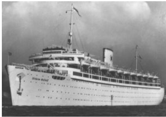
Figure 10. KdF Ship Wilhelm Gustloff

association KdF. 53 The complex, comprised of five seaside resorts was located on the island of Rugen in the Baltic Sea. The resort provided 20,000 rooms, festival square, event halls and had additional plans for restaurants, cinemas and sporting venues. All of which intended to distract average Germans and maintain their support for National Socialism.