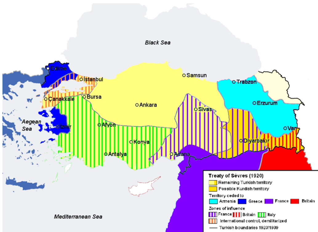
Figure 1. Treaty of Sèvres Map