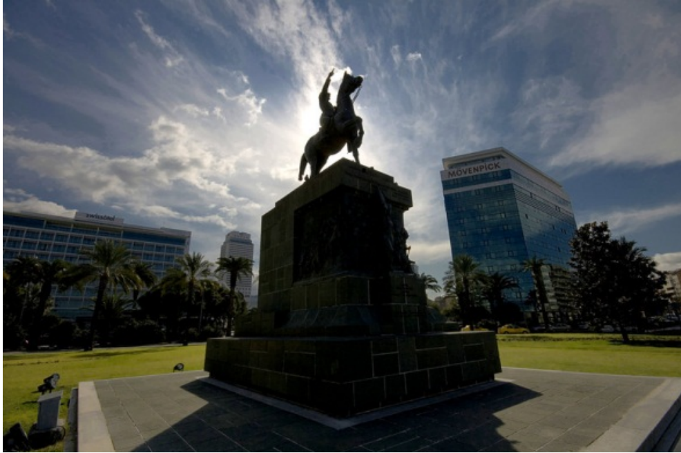
Figure 4. Atatürk Monument