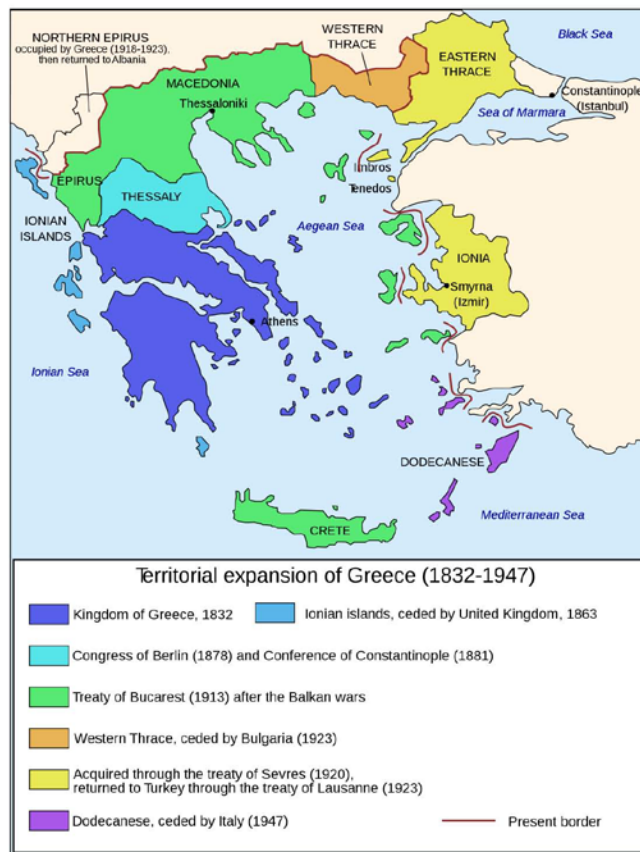
Figure 2. Map of Greece's Expansion 1832 1947

— Ioannis Kolettis before the constituent assembly in 1844