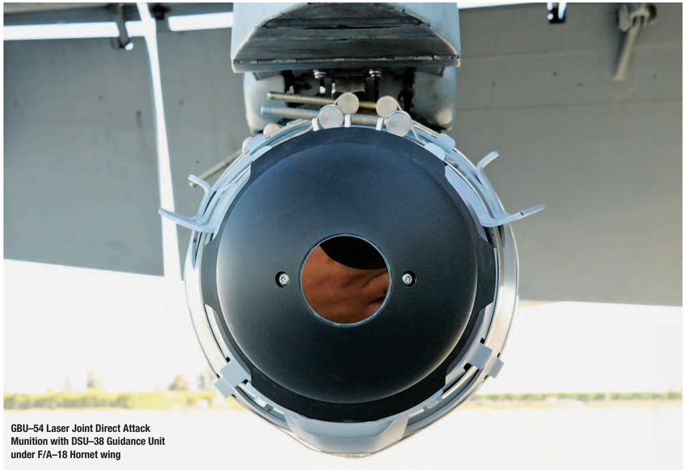
GBU-54 Laser Joint Direct Attack Munition with DSU-38 Guidance Unit under F/A-18 Hornet wing