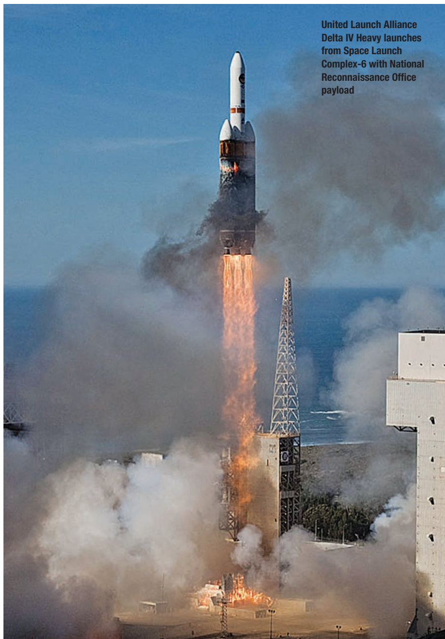
United Launch Alliance Delta IV Heavy launches from Space Launch Complex-6 with National Reconnaissance Office payload

weapons. Unlike ground forces, a pilot’s “bird’s eye” view of the battlefield is often less obstructed by terrain, although it can be severely diminished by vegetation. Nonetheless, pilots will make frequent use of direct-fire HEL weapons for offensive air support. This is the concept for the U.S. Air Force Advanced Tactical Laser (ATL). Currently mounted on a C-130, although envisioned for other aircraft to include the V-22 Osprey, the ATL is designed as a close air support weapon using a Mega-Watt class HEL. 20 In September 2009, the ATL penetrated an unoccupied stationary vehicle in 8 seconds from an undisclosed altitude and distance. 21 While