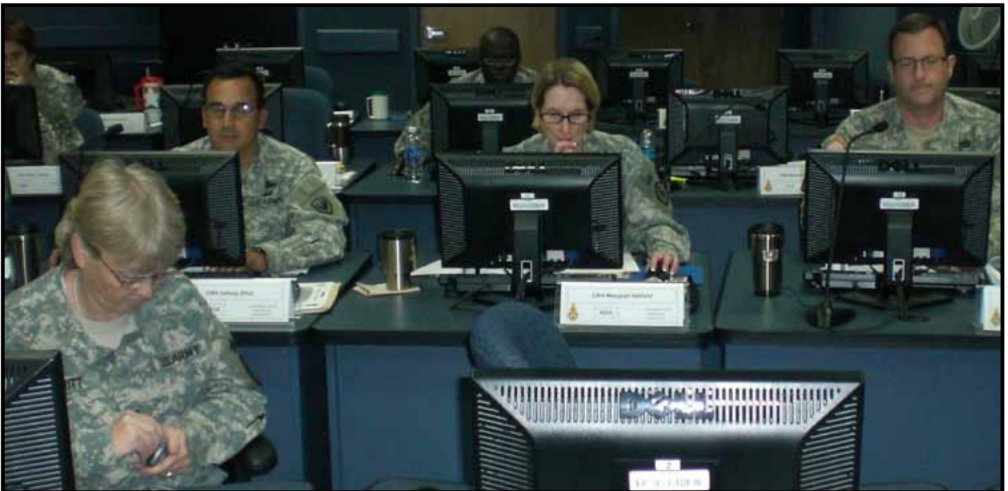
Senior warrant officers are immersed in the latest technology and most advanced systems when they attend their Professional Military Education course at the Warrant Officer Career College.

Another example of a shift in capabilities that has second and third order effects to include influencing Signal warrant officers is that of frequency and spectrum management. In the past, select Soldiers were trained in frequency and spectrum manage-