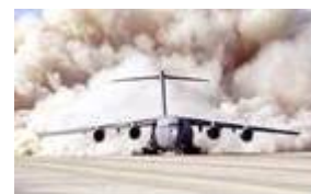
C-17 Strategic Airlift Aircraft

Installation of LAIRCM is still top priority. All eight ANG C-17 aircraft are funded by the FY 2009 and FY 2010 supplemental appropriations to receive LAIRCM upgrades. Currently, the LAIRCM contract is under renegotiation and the production line should resume in early FY 2011.