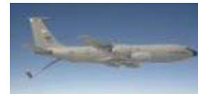
KC-135 Air Refueling Tanker Aircraft

Required changes in employment concepts place the KC-135 in high threat areas, and drive a requirement to add IRCM. The RC and AMC are working a combined test effort to determine a viable solution that meets the required performance parameters. Currently, there is no funding for IRCM on the KC-135. Numerous CNS/ATM compliance items, an integrated flight director/autopilot, and an electronic engine instrument display are included in the Block 45 upgrade. Other items listed as requirements, but not yet funded are tactical data link (TDL)/RTIC systems and enhanced external overt/covert lighting.