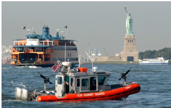
Defender Class Response Boat

There are two main platforms available for reserve mobilization and training: the Defender Class Response Boat and the transportable port security boat (TPSB). The Defender Class serves as a mobilization platform for nearly 2,000 reservists assigned to Coast Guard stations throughout the nation. The TPSB is the platform for members assigned to PSUs.