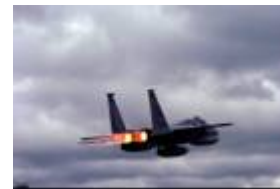
F-15 A/B/C/D Air Superiority

The F-15's number one modernization priority is the APG-63(v)3 AESA radar. The AC is also modernizing its F-15s with the same (v)3 radar, so no compatibility issues exist. The FY 2008 and FY 2009 bridge emergency supplemental added $34M to this ANG effort and placed four AESA radar systems on contract for the ANG. For FY 2010, the ANG received $32M to keep the (v)3 production line open and field an additional four AESA radar systems at Barnes, MA to operate with the Northeastern U.S. Air Defense Sector. To date, 22 AESA systems are funded for the ANG out of a total requirement of 48. The ANG F-15C community is pursuing procurement of SATCOM radios to fulfill an Air Force Northern Command (NORTHCOM) urgent operational need for BLOS capability. ARC-210 SATCOM radio fulfills this requirement and is already fielded and sustained in other ANG and AC fighters. ANG is working with the program office to field an initial stand-alone, non-integrated capability in 2011 funded with NGREA to meet the most urgent need at air sovereignty alert units. AC is planning to fund the remaining aircraft and develop a fully integrated installation in FY 2012–2013.