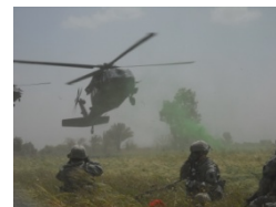
TACP in Action

This combat capability continues to struggle with the various stages of equipment modernization. Numerous critical mission assets are obsolete, non-procurable, or simply have not been fielded to the organizations; resulting in the units lagging behind their AC counterparts in critical mission areas. Continual technological advances in vehicles resistant to improvised explosive devices have made the selection of a standardized tactical vehicle extremely difficult and the lack of a decision has led to a non-standard fleet. Shortfalls with the primary communications system (AN/MRC-144) and the testing and development of the replacement system leave many units unable to fill all mission requirements in support of Army mission areas. Industry-wide shortages of approved body armor have all organizations scrambling to equip their TACPs with the best available protective equipment capabilities just before deploying.