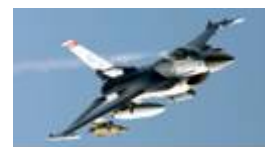
F-16 C/D Fighter

Modernization efforts are underway to improve the contingency war fighting and HD capabilities of ANG F-16s by fielding SLOS and BLOS communications suites, higher data rate processors, center console display unit (CDU), HMIT, enhanced self-protection suites, improved radar performance and reliability, and the advanced identification friend or foe (AIFF). NORTHCOM has identified AIFF and BLOS communications as critical requirements for HD. NGREA funding successfully initiated the HMIT, CDU, and AIFF programs. However, the lack of funding for HMIT and CDU in the current Air Force program objective memorandum (POM) generates significant risk for the procurement of these systems in FY 2013 and beyond. These are critical programs to achieve targeting and performance capability in parity with the AC fleet. The first increment of a SLOS/BLOS capability was funded primarily by the Air Force. ANG is currently working on the next increment that will enable simultaneous C2, intra-flight, and air-to-ground communications required in-theater. The F-16 critical combat priorities are: 1) HMIT, 2) center display unit, 3) radar enhancements with robust air-to-ground and air-to-air detection and identification, 4) improved radio-frequency/IR detection and self-protection, targeting pod upgrades and enhancements, and 5) implementation of SLOS and BLOS communication systems capable of simultaneous operations.