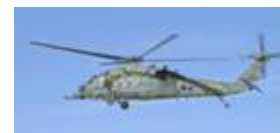
HH-60G Combat Rescue Helicopter

The ANG HH-60G fleet is currently involved in an NGREA-funded program for an avionics upgrade and addition of a data link, which includes dual smart multi-function color displays and situational awareness data link (SADL). Flight testing was completed in summer 2010 and installation started September 2010. AF-funded programs include an improved aircraft hover, hold system. The ANG funded a defensive weapon upgrade for aircraft in Alaska that operate with skis.