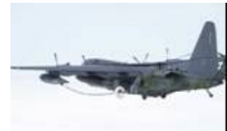
HC/MC-130 Combat Rescue Aircraft

Currently, there are no equipment compatibility issues between the active force and the ANG HC/MC130s. The ANG began a NAREA-funded program for its nine HC-130s and four MC-130s which upgrades its existing personnel locator system to the AN/ARS-6 LARS V12 capability. The Air Force is funding a communications and data link upgrade for all ANG HC/MC-130 aircraft; contract award is expected in FY 2011. Expected modernization shortfalls for the upcoming FY and through FY 2013 include crashworthy loadmaster seats for all ANG aircraft and dual rail cargo handling capability for a portion of the ANG aircraft.