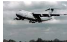
C-5A Strategic Airlift Aircraft

AC and AFR C-5B/M aircraft are modified with aircraft defensive systems (ADS) which permit operations in hostile environments. ADS for ANG aircraft was funded and is awaiting installation with anticipated completion in FY 2014. Without ADS, ANG C-5A aircraft were not permitted to enter certain airfields in the CENTCOM area of operations. Additionally, the lack of ADS decreases aircraft available to meet certain mission taskings, and increases the threat of undetected MANPADS launches. Due to funding constraints, the ANG C-5A fleet will have the following modernization shortfalls: 1) Stress corrosion cracking on the aft crown skin limits the cargo load factor to 80 percent and will be adjusted according to severity of the cracking. Total C-5A fleet cost to replace the aft skin is estimated at $297M. 2) Advanced IR countermeasure (IRCM) self-protective suite for $320.7M: Aircraft must be modified with ADS before any modification for the more advanced and effective LAIRCM can go forward.