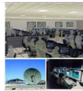
Air Force Distributed Common Ground System (AF DCGS)

There are no compatibility issues between ANG and AC DCGS; however, there are compatibility issues between DCGS, Predator SOC, and theater units. Crew voice communications between the two weapon systems is required to maintain situational awareness during mission operations. Delivery of the crew communications suite to all ANG DGS sites will permit crew voice communications between the Distributed Ground Station (DGS) sites only, but not to the SOC.