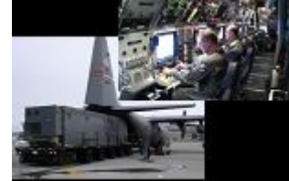
C-130 Carried SENIOR SCOUT

Upgrade and modernization efforts funded in the SENIOR SCOUT program encompass Baseline 5 upgrades of three SENIOR SCOUT shelters. In addition to the program funding, five efforts funded with Congressional marks were initiated in FY 2010: Communications intelligence capability upgrade valued at $2.4M, EO/IR capability valued at $4.8M, Line-of-sight data link valued at $2.4M, Remote operations capability valued at $2.4M, and support equipment for time-critical targeting valued at $3.0M. Additionally, NGREA funded capability for radio frequency cancellation valued at $6.4M, ($1.25M with FY 2010 NGREA and $5.15M with FY 2009 OCO NGREA).