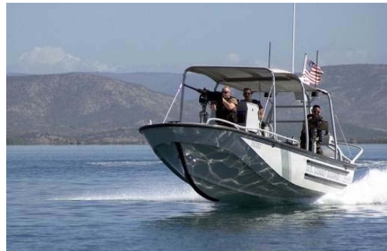
Transportable Port Security Boat