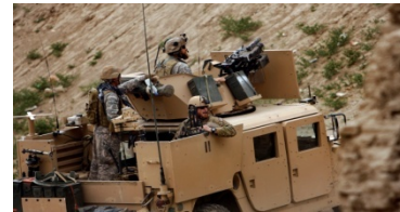
Special Tactics Team

The ANG is using NGREA funds to integrate and procure ground mobility vehicles capable of meeting the expectations of current and future operations (FY 2010 $1.8M). NGREA has also been used to fund an alternative insertion and extraction suite vital to sustain and improve special operations capabilities