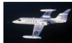
C-21 Special Airlift Aircraft

All 21 aircraft have been modified to comply with reduced vertical separation minimum (RVSM) airspace requirements. Enhanced Mode S (EHS) is currently required to operate in Europe; however, the C-21A has a waiver to operate without this equipment. The EHS modification is on hold, pending the outcome of the C-21 aircraft retirement decision.