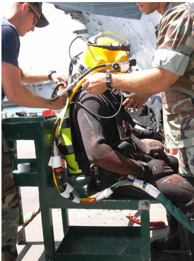
Figure 1. Sensor placement on diver's umbilical.

To avoid interfering with normal diving operations, the pressure transducer for each diver was attached to the existing surface-supplied umbilical between the shackle and the helmet behind the diver (Figure 1).