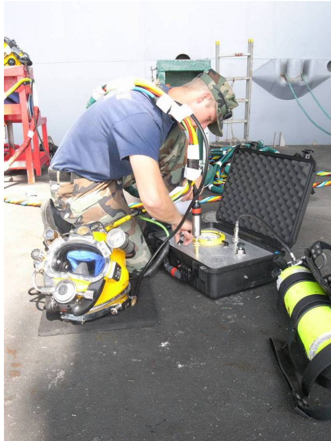
Figure 5. Diver setting up sensor verification. Care was needed to avoid excessive stress on the cable during verification.

window, accessible through the TDM's configuration screen, was used to match sensor readings to supplied pressures at 6 pressures. One downside to the initial configuration of the SVB was that the sensor needed to be oriented vertically above the SVB in order to perform the verification (Figure 5). The process of verifying a sensor while it remained attached to the diver's umbilical placed unnecessary stress on the flexible whip ends that had already been identified as weak points. A 10 ft adapter cable with a three-way split allowing simultaneous connection of all three sensors reduced the stress on the cable as well as the overhead on the dive side.