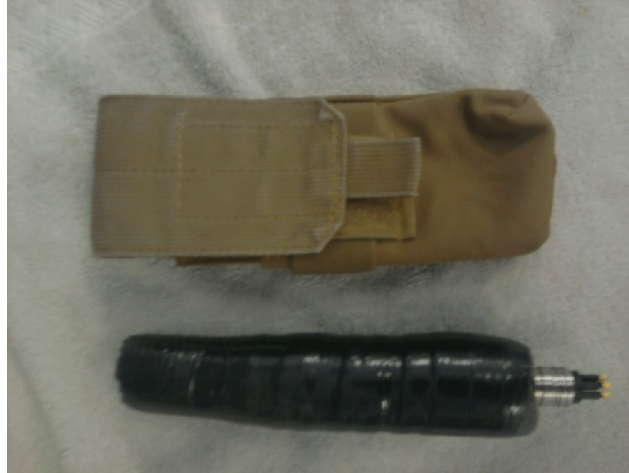
Figure 4. Foam-protected sensor and M16 double magazine pouch.

Some of the reason for having little data recovered from this fielding is that the waiver was delivered following a major period of ship availability. The summer did provide a good time to provide training, but it was not the most cost effective for obtaining operational ships husbandry dive profiles. A waiver extension that allows the TDM to be used for all of FY11 has been granted, 6 and following this extended period that starts with a trained crew, a collection of dive profiles that provides a more accurate summary of the benefits of the TDM should be available. This continued fielding will improve the cost effectiveness of the effort to collect operational dive data. During the next fielding of the TDM, rather than sending NEDU representatives to cover the entire period, we will consider sending a training crew for two to four weeks to get the local dive side proficient in operating the TDM. This training period should be scheduled during a slight lull (non-24/7 operations), but with a sufficient number of dives to gain experience before the dives of interest are begun. This fielding procedure would permit a lower cost method of leaving a prototype TDM system in place for an extended time to record data from dives with schedules subject to operational considerations beyond those of our evaluation.