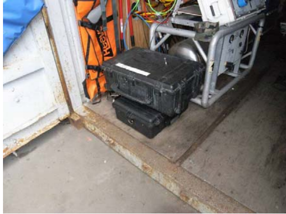
Figure 2. Sensor interface box placed inside van and next to FADS console.