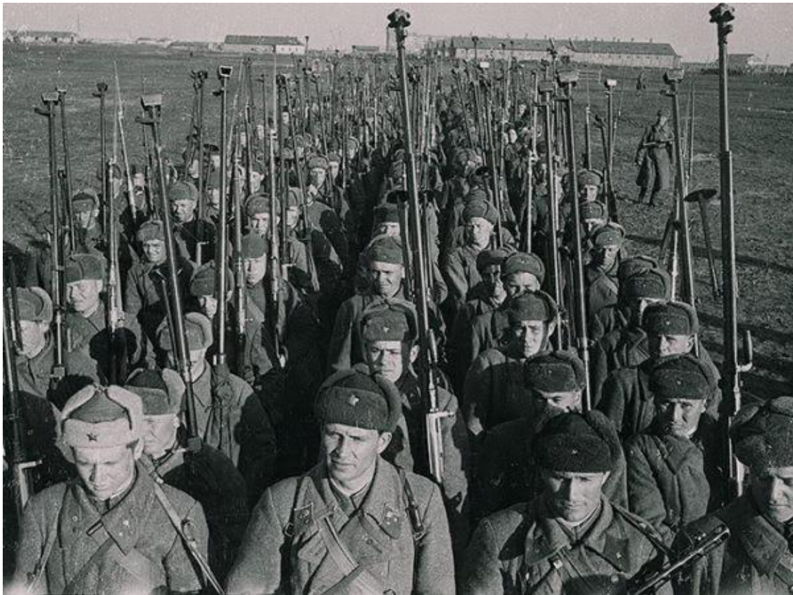
Figure 1. A WWII Soviet antitank rifle unit (note the size of the weapons).

In the case of very large values of C compared to M_p , which must imply a very high muzzle velocity weapon and cartridge system, and for the weapon to be able to recoil forward as asserted by both Corner (1950) and Schmidt (1973) for high-efficiency muzzle brakes, k must clearly be negative. So there is a lot of room for discussion about the appropriate value for k ; clearly, it depends on many factors, including the weapon one is discussing, and, in particular, about the design of the muzzle brake. Figures 1 and 2 illustrate the size of some of these guns—in this case, some of the Soviet 14.5-mm antitank rifles. (Note the very large muzzle brake.)