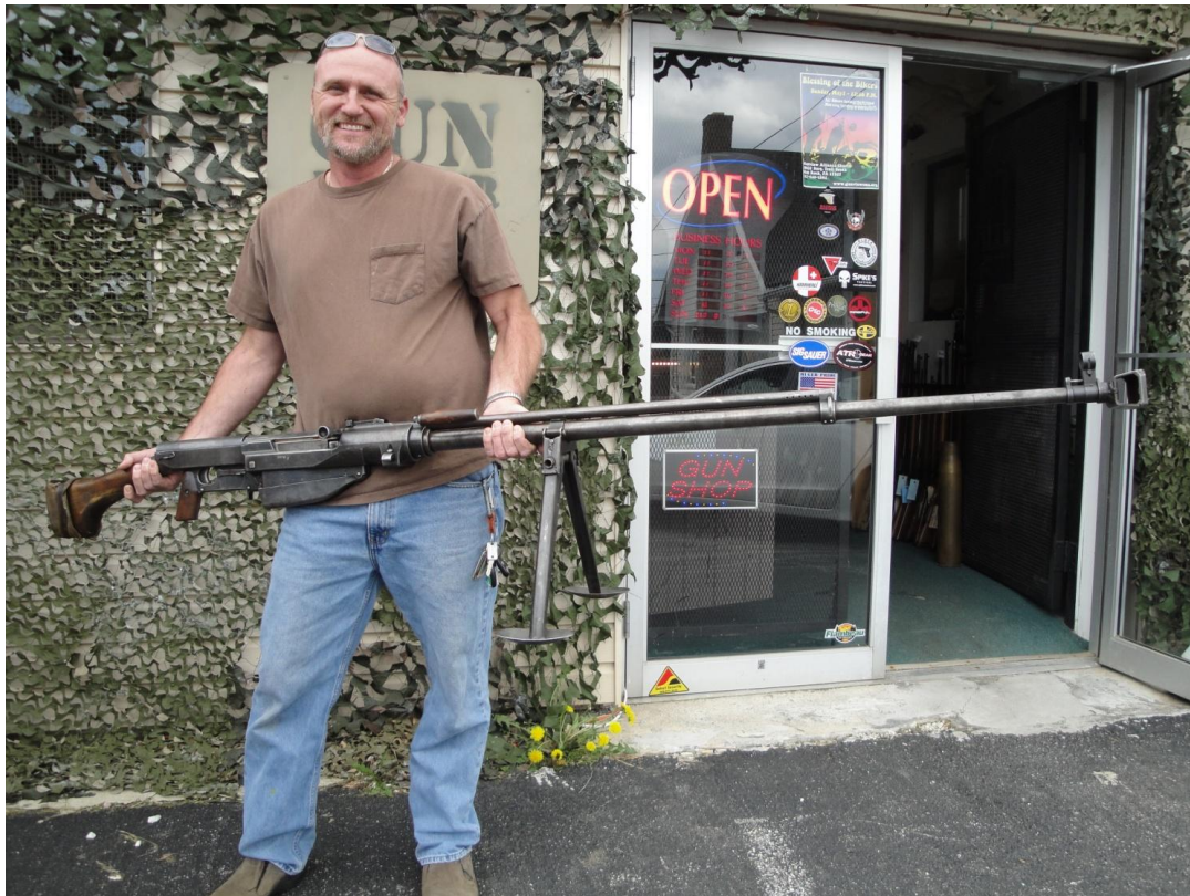
Figure 2. The Soviet gas-operated, semiautomatic 14.5-mm PTRS antitank rifle in detail.