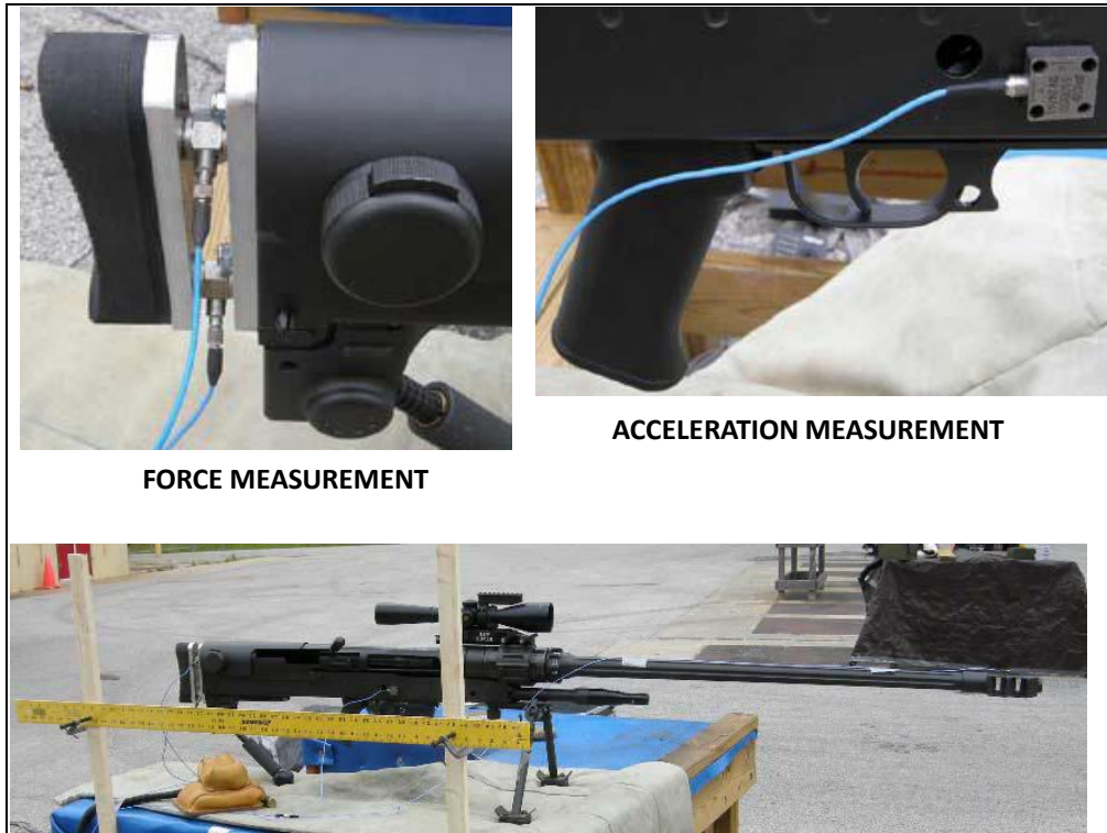
Figure 3. Experimental arrangement to make force measurements during firing based on the Steyr AMR.