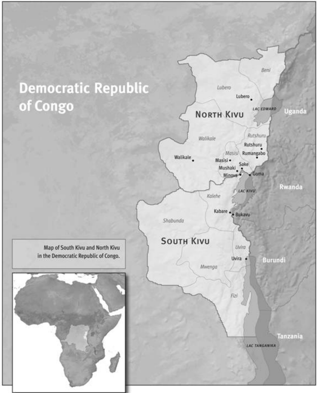
Figure 1. Map of South Kivu and North Kivu