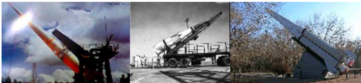
Figure 4. From left to right: Chinese Fanji, US Sprint, Russian Galosh ABM interceptors.