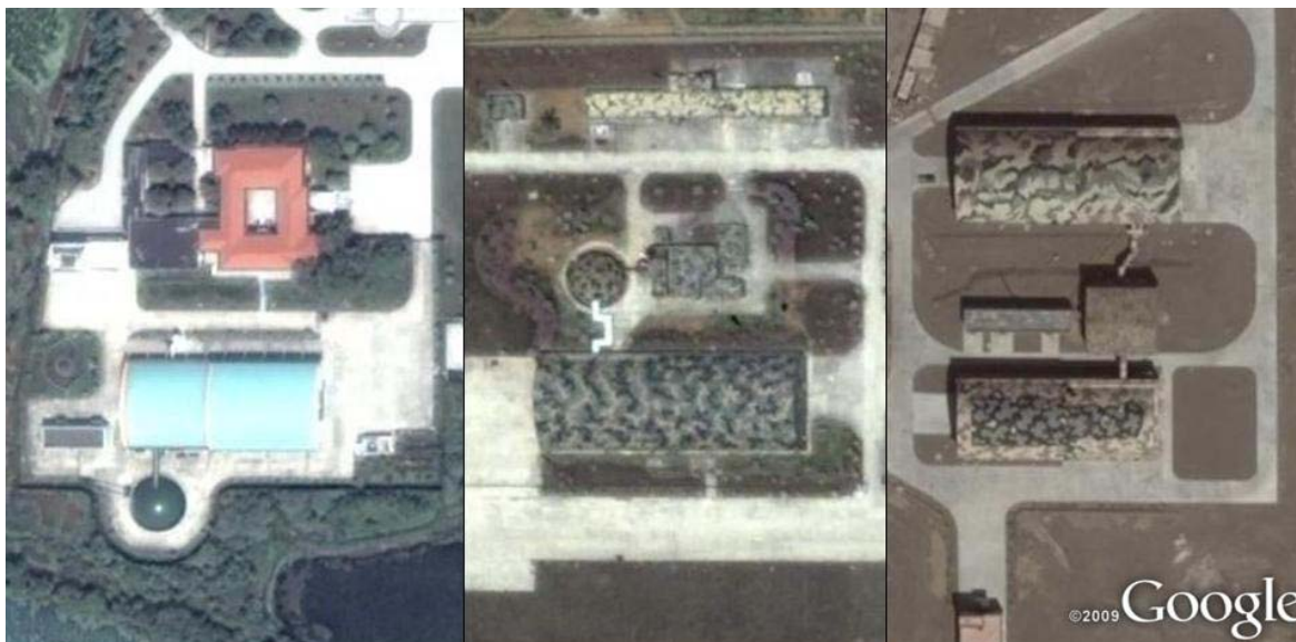
AIOFM - Hefei