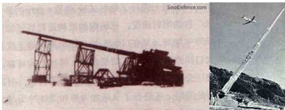
Figure 5. Possible Chinese “supergun” (left) and U.S. Project HARP gun (right).