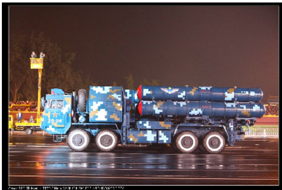
Figure 6. Chinese HQ-9 surface-to-air missile.