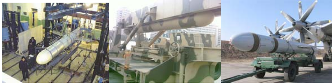
Figure 2. From left to right: A possible Chinese DH-10 LACM; Pakistani Babur LACM, Russian AS-15 Kent (KH-55) LACM.

China included a block of DH-10 launchers in its 2009 National Day Parade. Each launcher carries three tubes for missiles. By 2009, China had approximately 150-350 DH-10 missiles and 40-55 launchers.