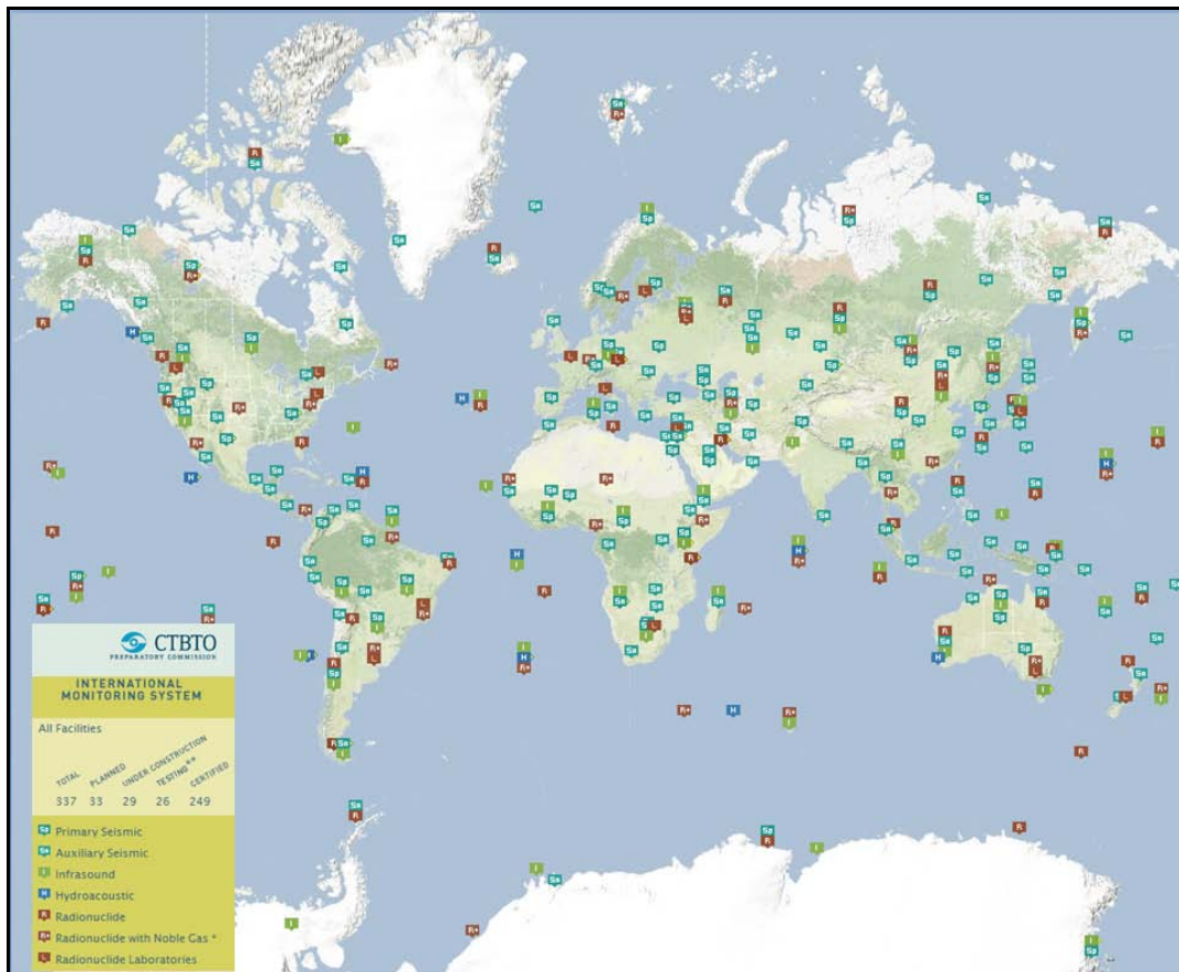
Figure 3. CTBTO International Monitoring System Sites 26

System is composed of four parts to detect a nuclear explosion: seismic, hydroacoustic, infrasound and radionuclide.