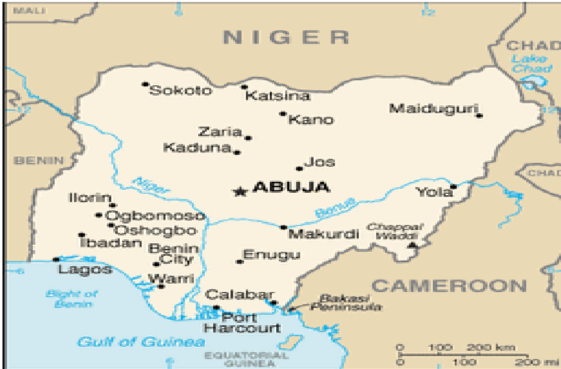
Figure 3. Map of Nigeria