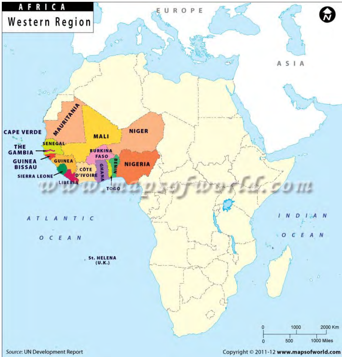
Figure 1. The Sixteen Countries of West Africa