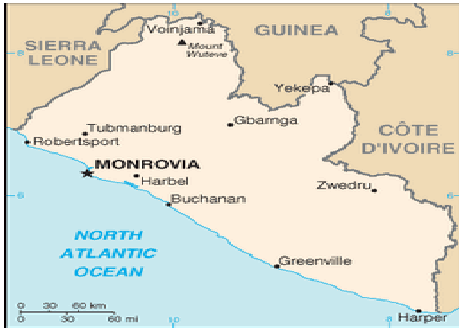
Figure 5. Map of Liberia