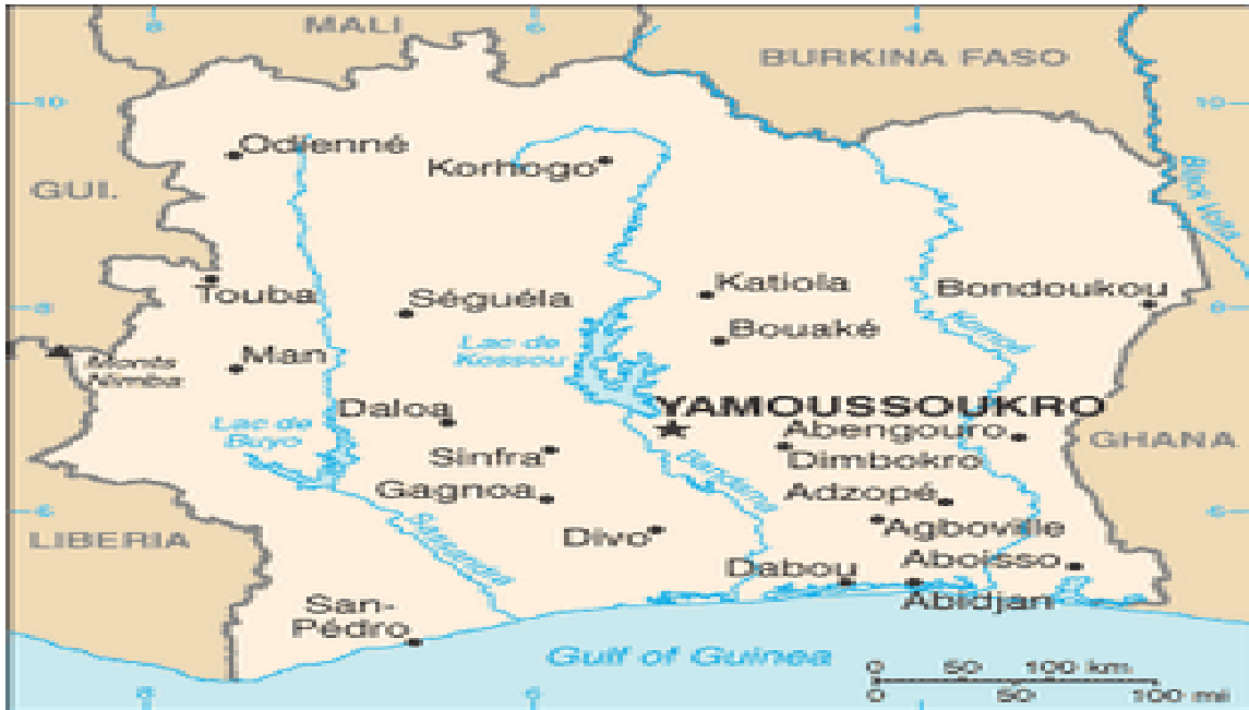
Figure 4. Map of Cote D'Ivoire