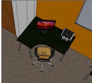
Figure 1. Example scene imagination based on linguistic description

Consider the task of generating a static scene described by text utterances in a 3D virtual environment. For example, generating a scene with “a chair in front of the table” and subsequently placing a “printer on the table.” The desired rendering of the scene is shown in Figure 1.