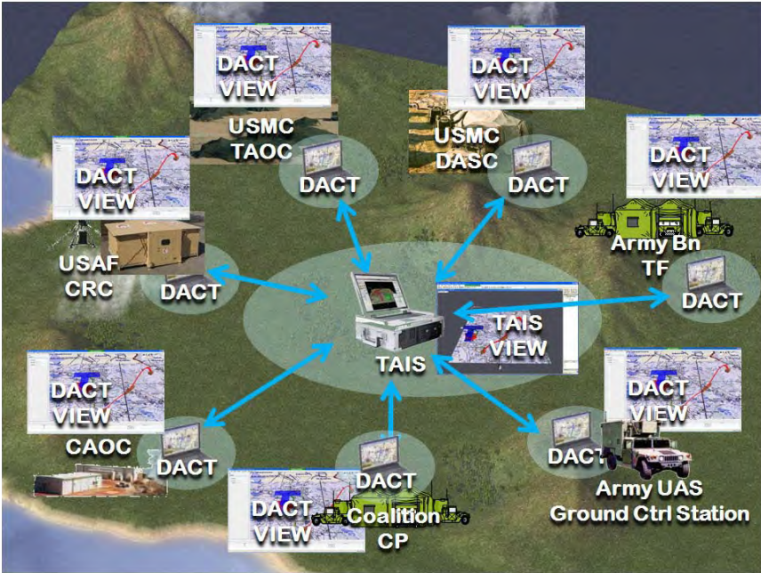
Figure 2. TAIS and DACT Shared Visualization and Collaboration

The dominant driver of airspace requests during CAGE was immediate missions that did not need to be approved by the Joint Forces Air Component Commander (JFACC)/Airspace Control Authority (ACA) at the Aerospace Operations Center (AOC). Since the USAF CRC was granted authority for these missions, they did not need to be submitted to TBMCS at the AOC for inclusion in the daily ACO or change ACO. Missions requiring rapid response, such as MEDEVACs, fire missions, and close air support were initiated at the task force level and communicated to RC-S for deconfliction approval and CRC clearance. RC-S, using VOIP and chat would communicate back with the requesters to discuss intentions, changes, conflicts, and other pertinent details. Once a consensus had been reached by all stakeholders, the requests would be approved or denied accordingly.