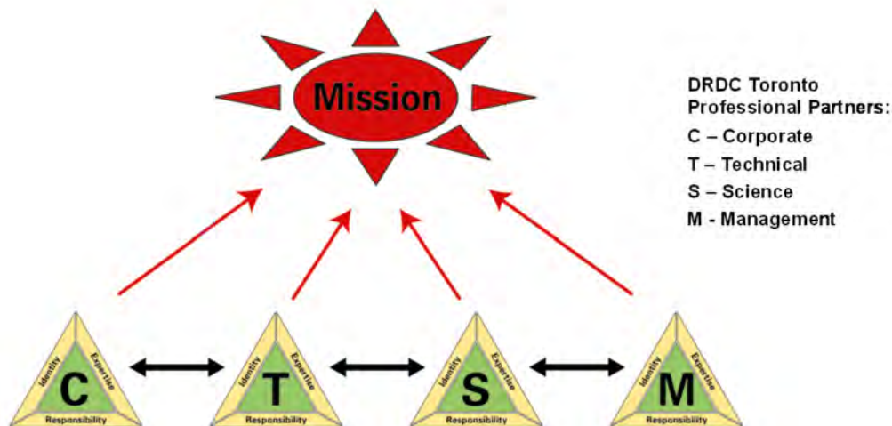
Figure 1. Professional Partners within DRDC Toronto work in partnership towards achieving the mission

Critical to the success of the OAP is the successful implementation of a PPP. This recognizes that the DRDC mission would best be achieved through a culture of collaboration, mutual respect and recognition of the value that each partner brings to the organization. Each partner's unique identity, role and expertise are captured in framework documents that provide guidance and clarity to members of each profession, as well as providing a transparency to other professional partners. This transparency is critical, as the framework documents also specify the relational and information requirements that are required between partners in order to permit optimal function and integration.