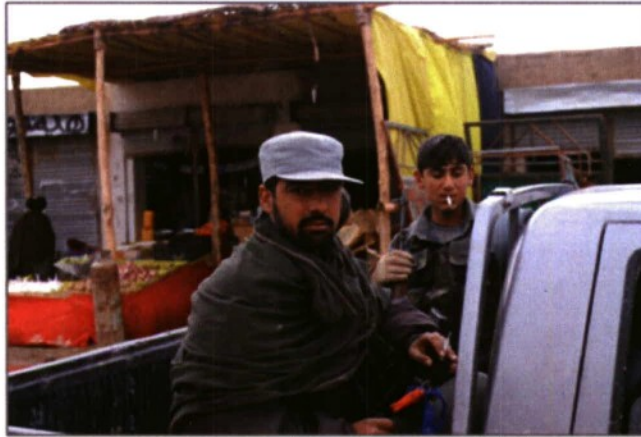
a.

The way the Afghan public views corruption, however, is not easily defined. Several cultural advisors told the author that people may be willing to provide an extra “fee” or “gift” to get paperwork processed, as long as there is some standardization (i.e., the bribes seem fair) and the amount required was not excessive. Moreover, people in Helmand are used to resolving disputes by negotiation. Thus, they may be comfortable with a police force that negotiates based on personal relationships, fees, and bribes as long as they think that this negotiation will help them leverage more favorable outcomes. Based on several months of interviews with residents of Lashkar Gah, a cultural advisor concluded that “people want a rules-based, 'black and white justice' when the police are dealing with their neighbors, but favored a more negotiated form of justice when the police are dealing with them” [14].