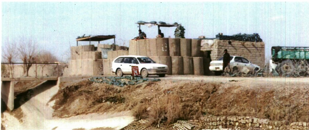
a. Photo by Patricio Asfura-Heim, CNA

The public's perception of police patrols is not clear. Residents of areas that have seen significant improvements in security over the past few months report that they are satisfied with regular police patrols. For example, residents of Lashkar Gah have seen traffic police stand watch every day on nearly every street corner of the municipal center since 2009 and now report that the constant