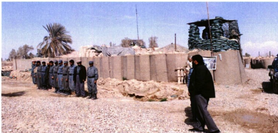
Figure 4. Omar Jan, Garm Ser district police chief, inspecting a patrol base with police and arbakai guards in March 2011 a

One way to get the benefits of local and non-local police is to have locally recruited police patrolmen serving under officers from other areas (figure 4). If these officers are willing to engage with the local leaders and the public, they may be able to make objective decisions while also understanding local issues.