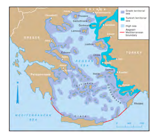
Figure 1. Current Territorial Sea Distribution in the Aegean (six nautical miles).<sup>58</sup>

Turkey maintains the position that extension of the territorial seas is unacceptable as all shipping to and from Turkey's Aegean ports and, indeed, that any transiting of the Turkish straits to and from the Black Sea requires one to pass through Greek territorial waters. Pointing out that Turkey itself has extended its territorial seas to twelve nautical miles off its Black Sea and Mediterranean coasts, Athens stresses the fact that the navigation rights, covered by the right of "innocent passage" laid down in the 1982 UN Convention, would not be threatened by an extension of Greek territorial waters to twelve nautical miles. As the breadth of the territorial waters impacts the ownership claims of the continental shelf beneath them and the airspace above them, Greek security analysts consider this challenge part of Ankara's overall revisionist aspirations in the Aegean.