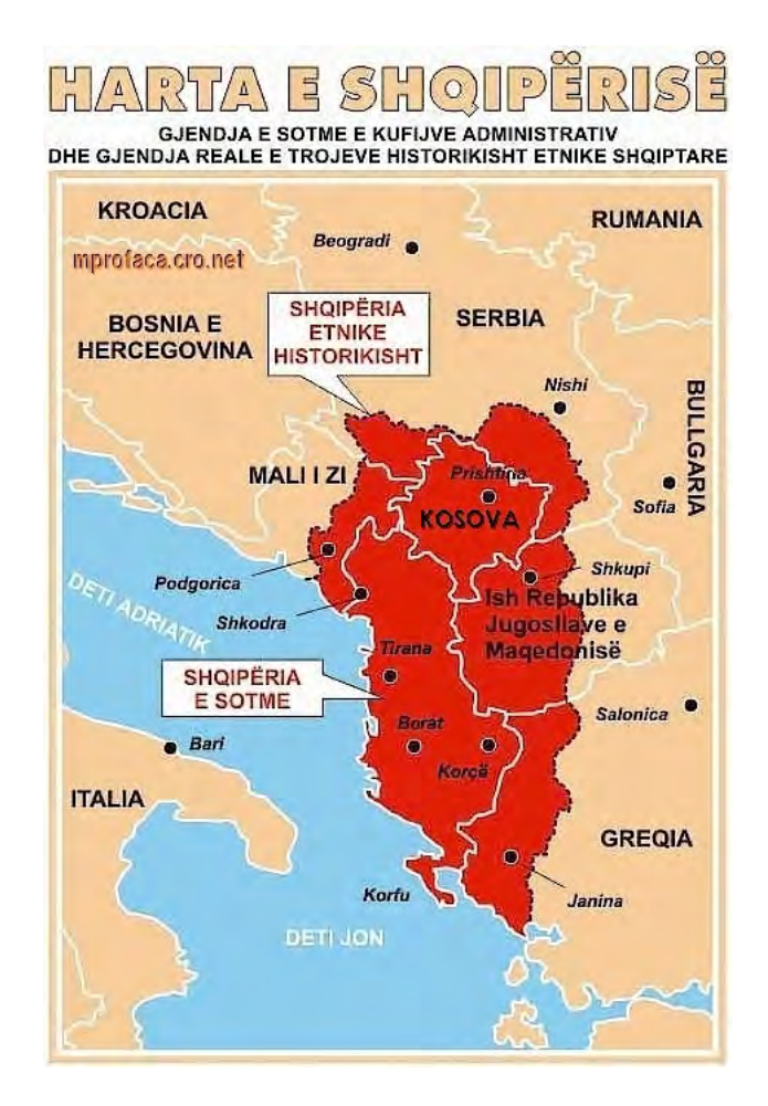
Figure 3. Albanian Map Depicting the Borders of "Great Albania." 79

as part of this agenda seeks political control over part of Epirus—the northwestern region of Greece—claiming it to comprise an organic part of the Great Albania.<sup>78</sup>