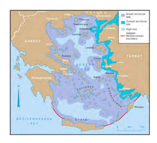
Figure 2. Possible Territorial Sea Distribution in the Aegean (twelve nautical miles).<sup>59</sup>