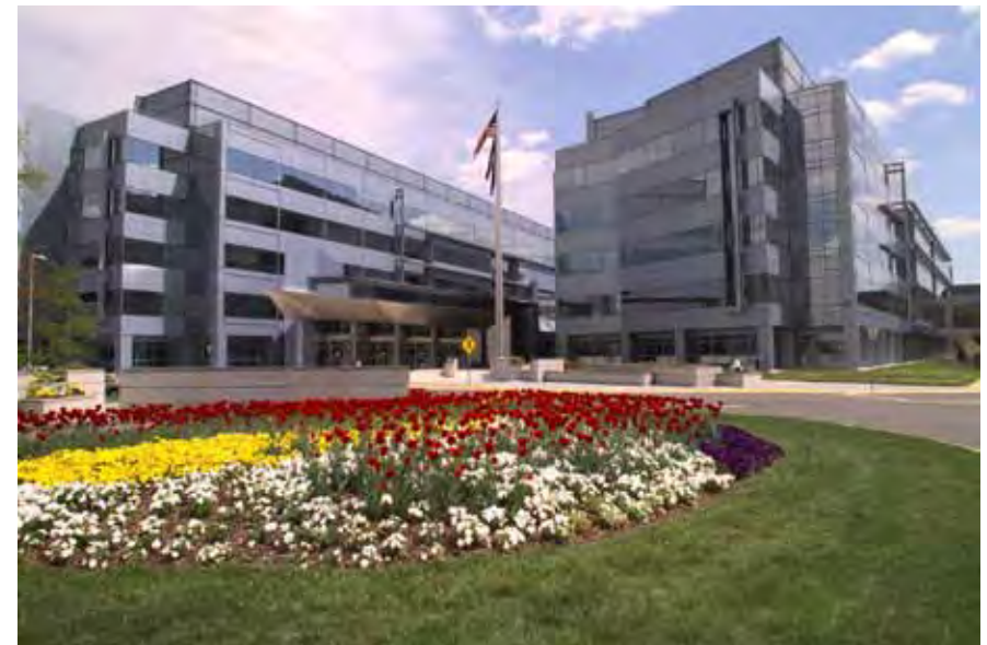
Figure 10: NRO Headquarters Today

FIA became a continuing problem for the NRO. In May 2003, a joint Defense Science Board and Air Force Scientific Advisory Board task force found that FIA was "significantly underfunded and technically flawed." In 2005, DNI John Negroponte