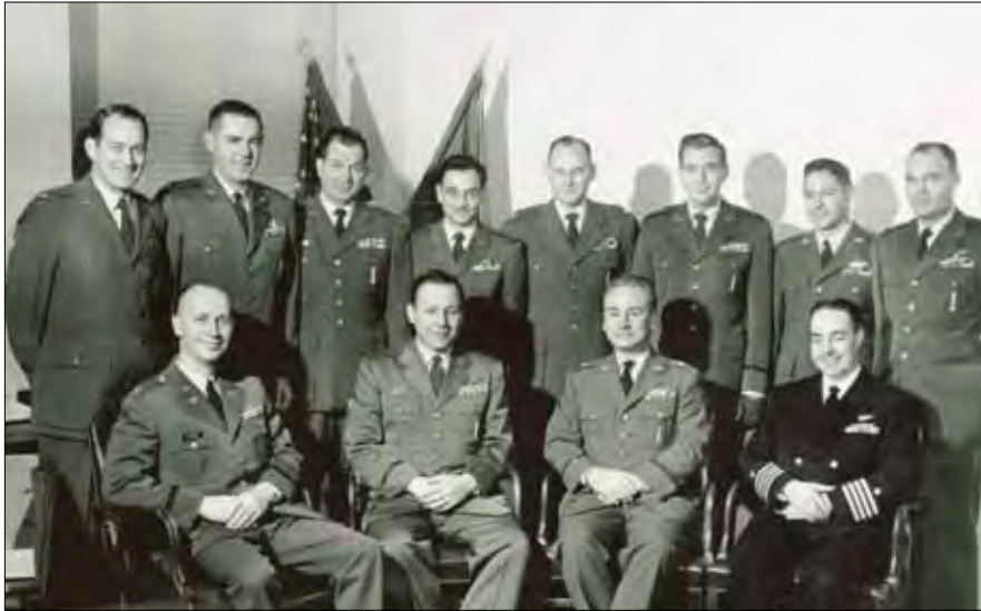
Figure 1: Original National Reconnaissance Staff, 1961