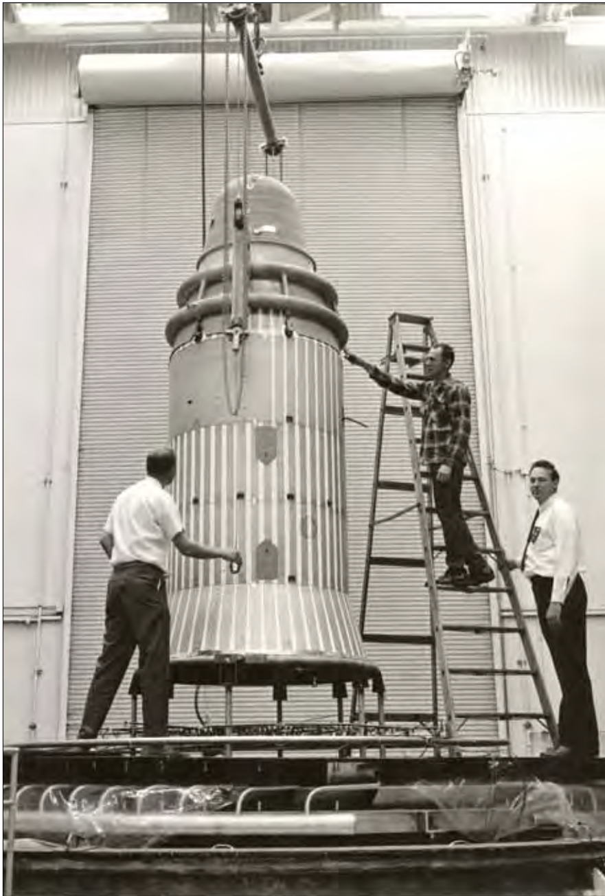
Figure 6: Engineers Ready Corona