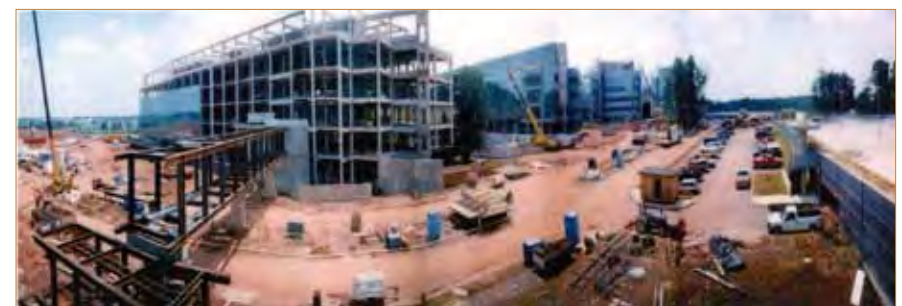
Figure 9: NRO Headquarters Under Construction

A joint review carried out by the Defense Department and CIA found no intent by NRO officials to mislead Congress and that the NRO had provided cost data to