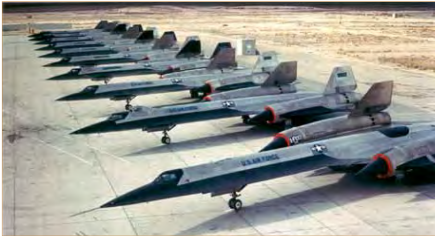
Figure 3: The SR-71 Aircraft