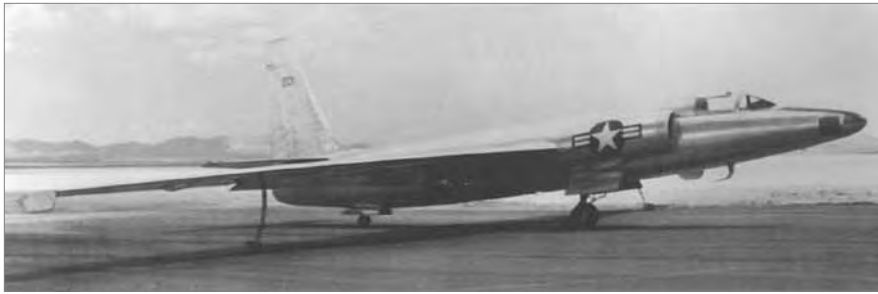
Figure 2: The U-2 Aircraft