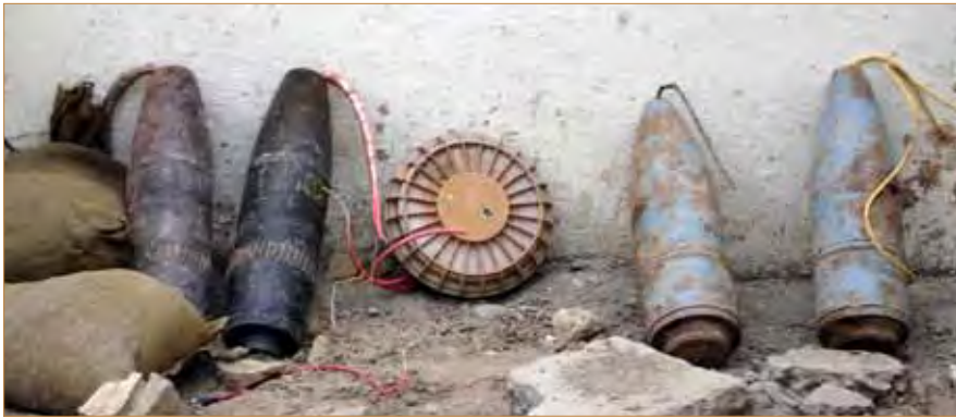
Figure 11: IED Munitions in Baghdad