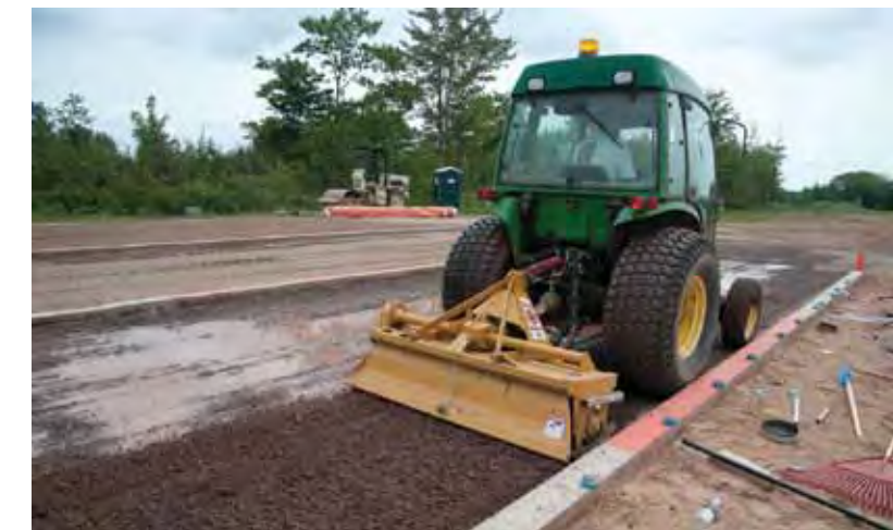
Image 6. KRC test lanes.

Soil types. Three different test lanes, with dimensions 4.88-meters wide by 35-meters long, were utilized, each containing a different type of soil. The soil types were based on the standard test soils described in the CEN Workshop Agreement 15044:2004. 2 The soil types used were: screened topsoil (similar consistency to planting soil), silt/gravel mixture (a low-moisture, silt-gravel soil) and 22A road gravel (common gravel used for road construction).