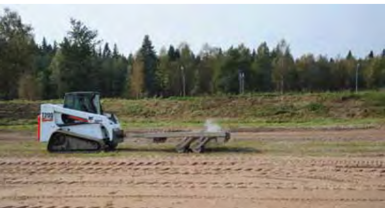
Image 8. SCAMP Roller with a Bobcat T-200 prime mover.