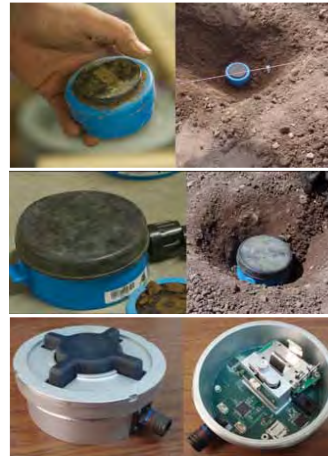
Image 3 (top). Inert Type 72A test mine. Image 4 (middle). Inert PMN-1 test mine. Image 5 (bottom). KRC PMN-2 SIM test mine.

Test equipment. A 2-meters wide version of the SCAMP Roller pushed by a Bobcat T-250 skid steer loader was utilized for the majority of testing. For the high-speed testing, a high-mobility multipurpose wheeled vehicle prime mover was utilized.