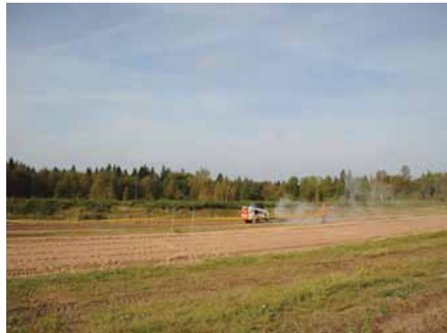
Image 10. SWEDDEC test lanes.

ful “detonations” versus available targets. For the PMN-2 SIMs, a successful “detonation” is denoted by any measureable pressure-plate deflection. Results are analyzed for each mine type in the following categories: