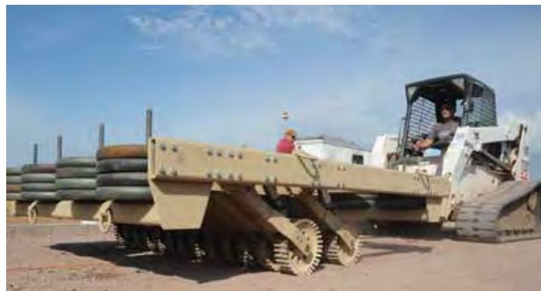
Image 1. HRI's SCAMP Roller.

Roller systems detonate landmines by applying enough force to the ground to trigger the mine. To be an effective tool, a roller must ensure that this force is applied evenly across its full width and is always above a predetermined threshold that is dependent on mine type, depth and ground conditions. To maintain an evenly distributed threshold ground force, the SCAMP Roller has a variable ballast system fixed above a set of independently suspended roller wheels. Each suspension element uses a purpose-built coil spring with a starting force and spring constant specifically tailored to provide relatively constant ground force throughout each roller wheel’s vertical travel range. This ensures a minimum ground-force threshold is maintained for each roller wheel during all operations. The roller wheels themselves are aggressively textured “paddle-wheel” type rollers that effectively transmit force to the ground while maximizing blast ventilation. The roller wheel width, paddle spacing and contact surface area ensure that force is translated to even the smallest AP-mine trigger mechanisms. The roller wheels are arranged in