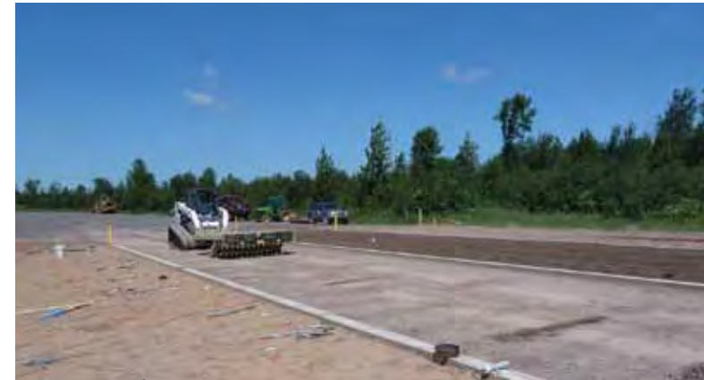
Image 2. SCAMP Roller with Bobcat T-250 prime mover.

A test lane was set aside in each soil condition by marking the outside edges and centerline. Each lane was conditioned by tilling the soil, adding moisture if necessary, and compacting until the desired level was achieved. The lane was divided into equal sections along its length—one section for each test mine. The mines were buried in the lane at the desired depth, and if they were placed below surface level, they were covered with overburden. The mine’s depth was measured from the top of the pressure plate to ground level. If required, the soil above and around