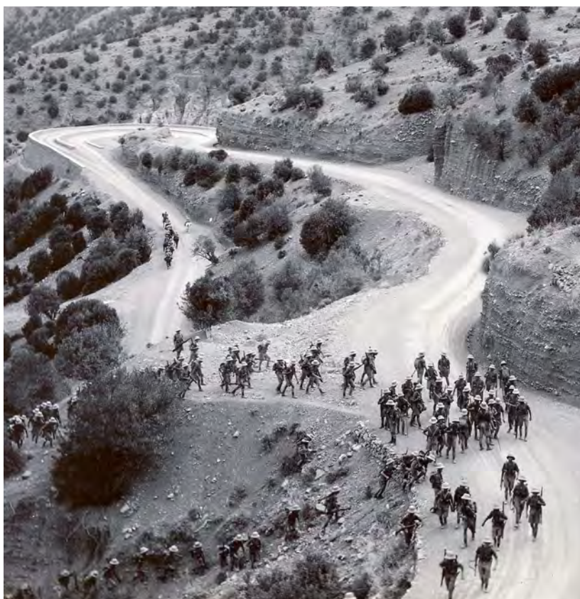
48th Regiment takes a short cut