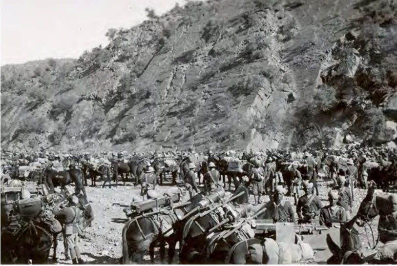
Pack mules ready to march with 48th Regiment (Sgt Partridge)