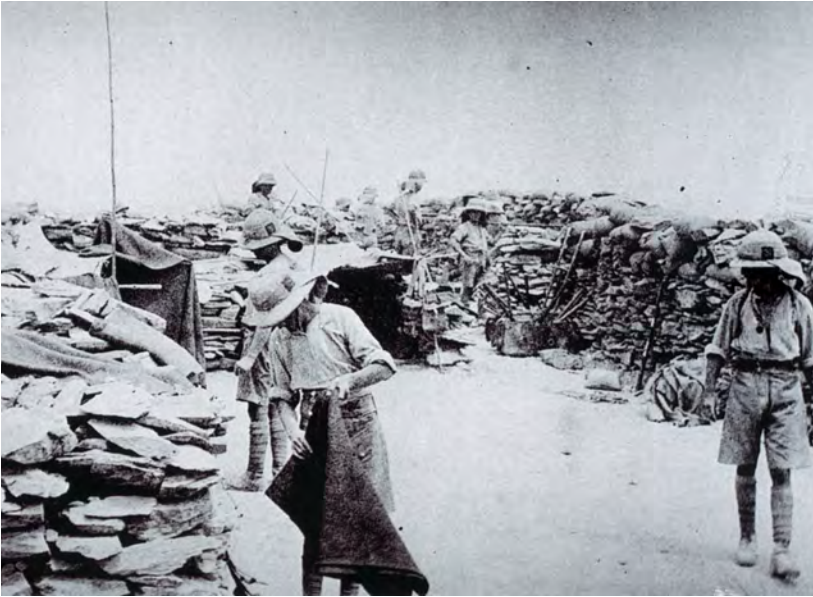
Interior of sanger occupied by picquet (NAM 60338)