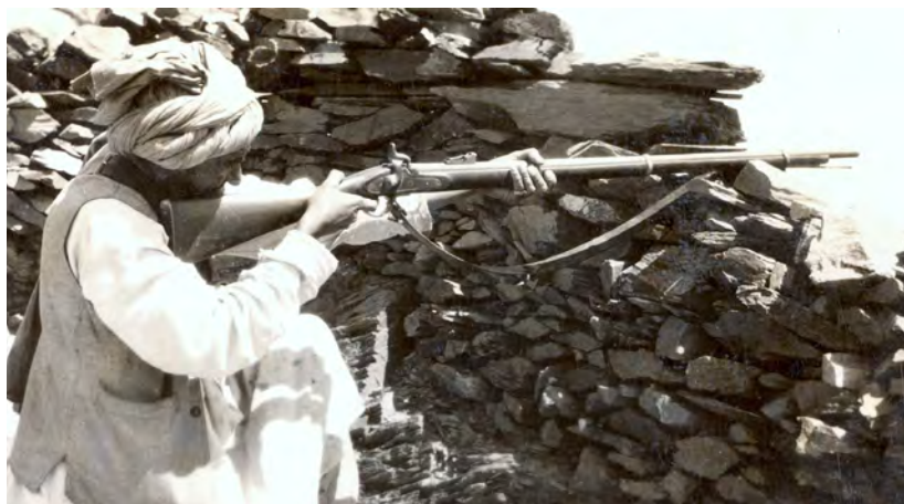
Tribesman posing in sanger