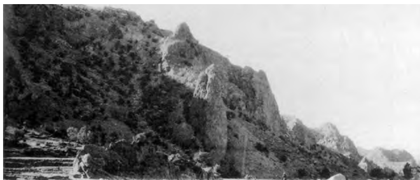
Mountainous terrain (NAM 96899)