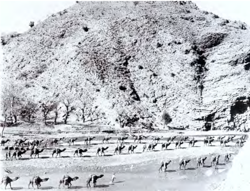
Camels and their handlers in march columns (NAM 99810)