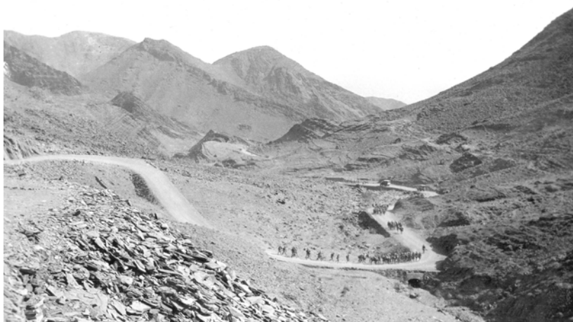
Main body of 48th Regiment moving to Razmak