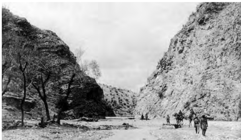
Dominating terrain for a march column (NAM 98080)