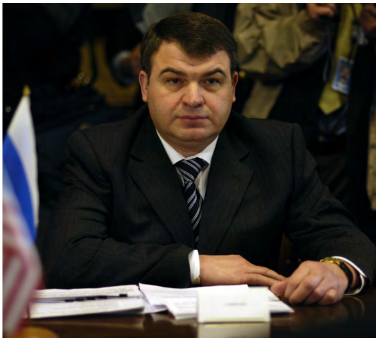
PHOTO: Anatoliy Serdyukov. By Cherie A. Thurlby (defenseimagery.mil) [Public domain], http://commons.wikimedia.org/wiki/File:Anatoliy_Serdyukov.jpg via Wikimedia Commons

The reform of the Russian conventional armed forces, announced in the aftermath of the Russia-Georgia War in August 2008, as part of an agenda that became known as the “new look” cannot be understood, or properly assessed, unless its fundamental drivers are defined. Overall, following Defense Minister, Anatoliy Serdyukov, declaring the key features of the reform on October 14, 2008 on the day he briefed a closed session of the defense ministry collegium, the reform agenda appeared guided by an effort to enhance the combat capabilities and combat readiness of their conventional armed forces, loosely centered on the paradigm of forming mobile, smaller and modernized forces. It seemed to make sense given the operational failings of the Russian armed forces during the Five-Day War, and marked a consistent and determined campaign to drag the military out of its twentieth-century table of organization and equipment (TOE) to re-equip, restructure and train for the conflicts of the twenty-first century. 1