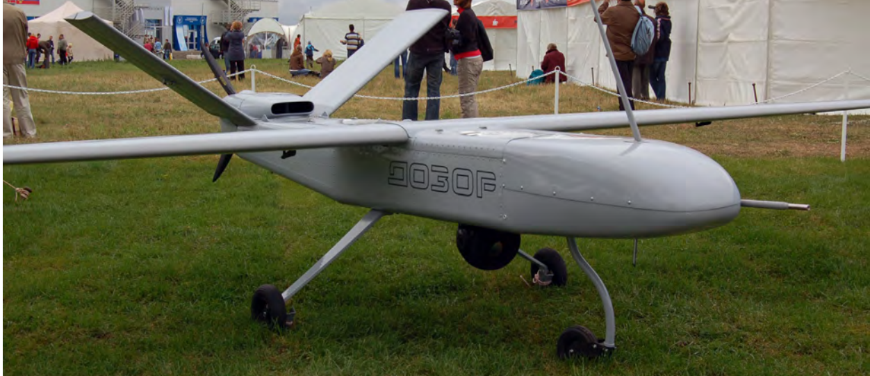
Dozor-100 UAV

conduct, especially at tactical level was unclear. 11 New experimental communications models were field tested during Kavkaz, Lagoda and Zapad 2009, but while this served to link the need to overhaul existing C 3 systems, a key aspect in the reform agenda, it also signaled an early linkage between the “new look” and developing network-centric approaches to combat operations. More than ten years ago, the use of radio sets at company level preceded their later introduction at squad level; studying these exercises convinced the General Staff of the need to equip every soldier with personal sets. Those using the automated C 2 system reported that it was overly complicated, and far from user friendly. Throughout 2010, officers received additional training in the use of the new system, as the technology compelled their retraining. 12