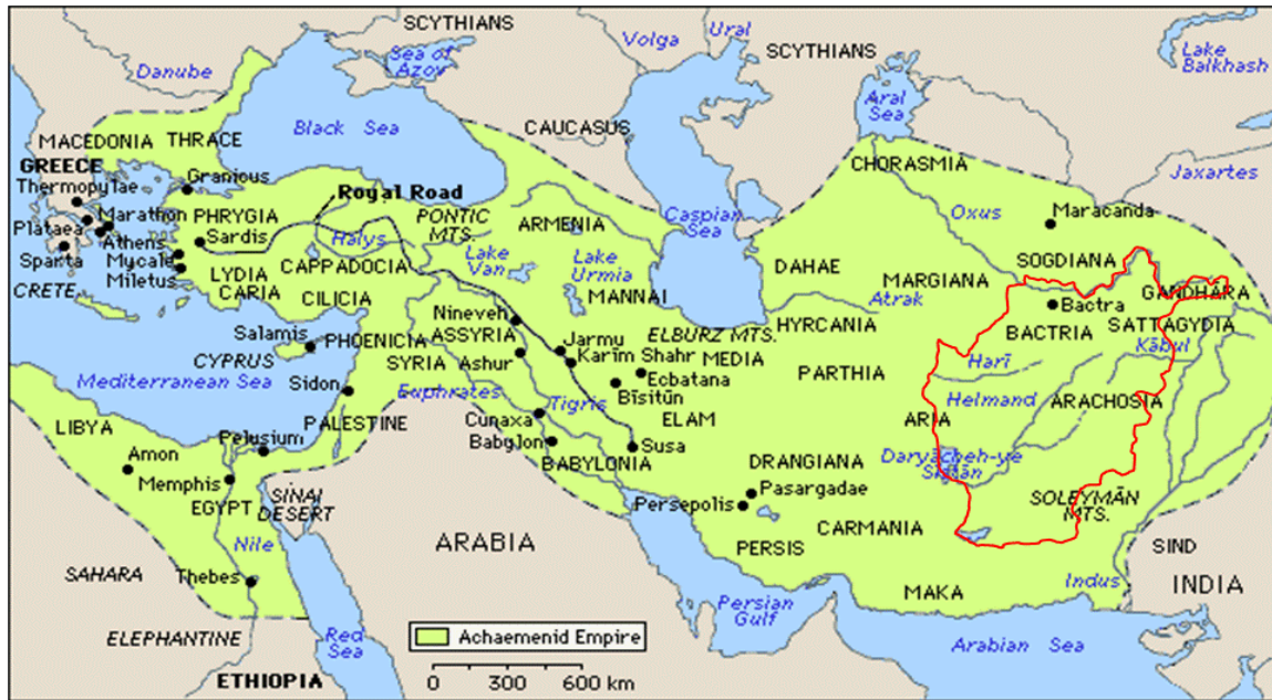
MAP 1: Achaemenian Empire 33

and was killed near Balkh, in northern Afghanistan. 31 The Achaemenian Empire of Cyrus and Darius conquered what is now Afghanistan and Pakistan for Persia, naming it Khorassan and making it the easternmost province of their empire. 32 Persian satrapies in Afghanistan included