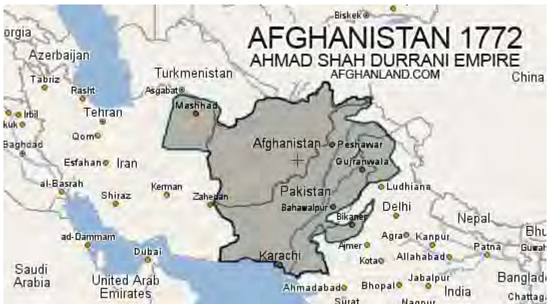
MAP 5: Durrani Empire 68

the Durrani empire expanded well beyond these areas and established varying connections with its diverse subject groups. Thus, the connection between the core Durrani Pashtun and the state was different from the connection established with the Ghilzai Pashtun, the Persian, the Turk and the Sindhi. The boundaries of the empire were formed by conquest and personal allegiance, with little expectation of permanence. Finally, the Durrani empire depended on the continued invasion, conquest and pillage of new territories to maintain the feudal loyalty of its core of Pashtun tribes and to sustain the economic requirements of government. While the decline of the Mogul empire in India appeared to open a way to sustain the empire, the increase of British power in India and British support to the developing Sikh kingdom in Punjab would block this outlet to the detriment of the Durranis.