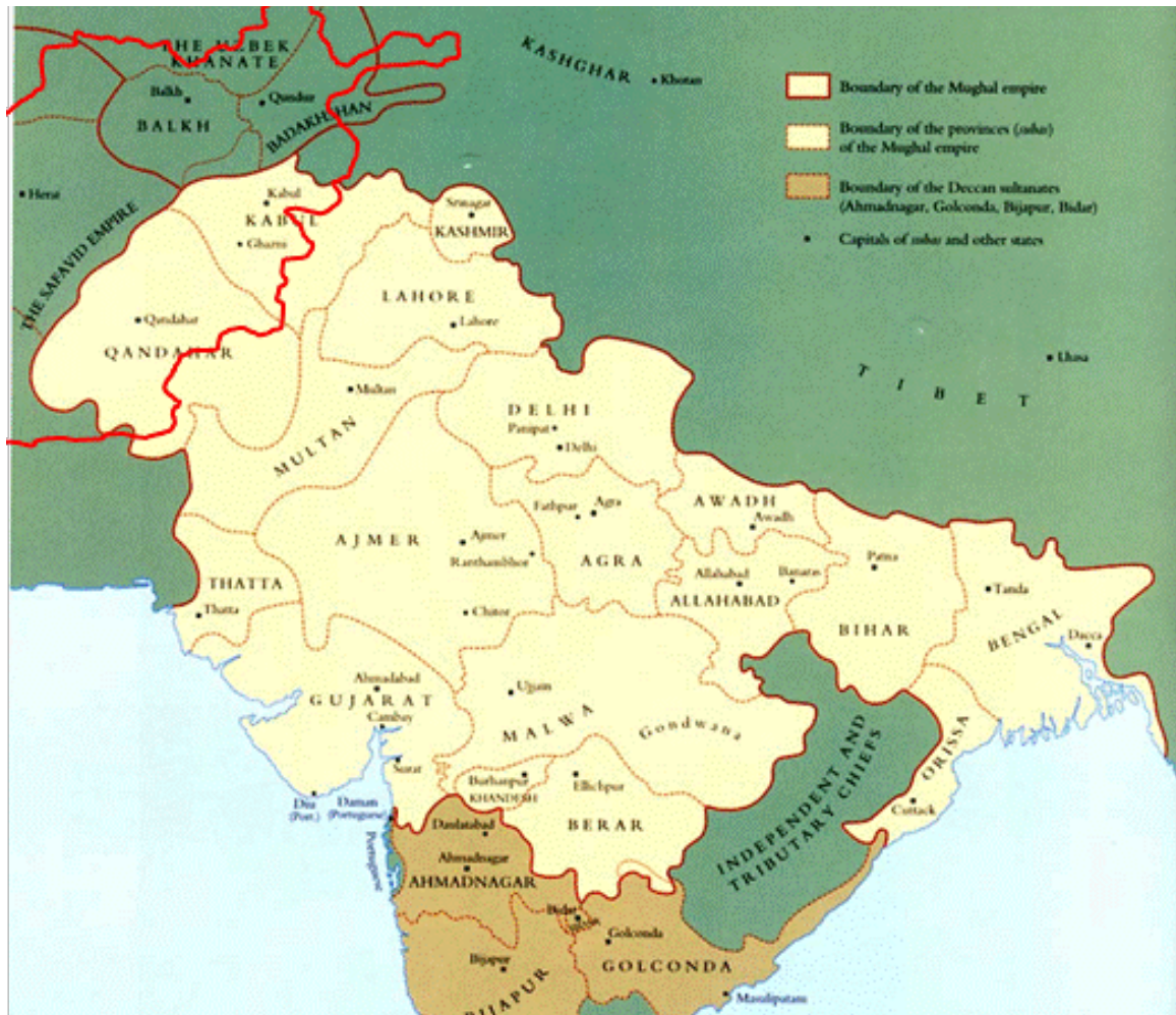
MAP 3: Mogul Empire 53

The changing nature of global trade also hindered the recovery of Afghanistan following the devastation of Genghis Khan and Tamerlane. The development of maritime trade routes diminished the value of Afghanistan, since it no longer dominated the only trade routes between the Middle East and India and the Far East. The decreasing volume of trade and the feudalization and conflict in Afghanistan and Central Asia formed a reinforcing system, where increased conflict drove up the cost of goods and decreased trade, which increased conflict. 54