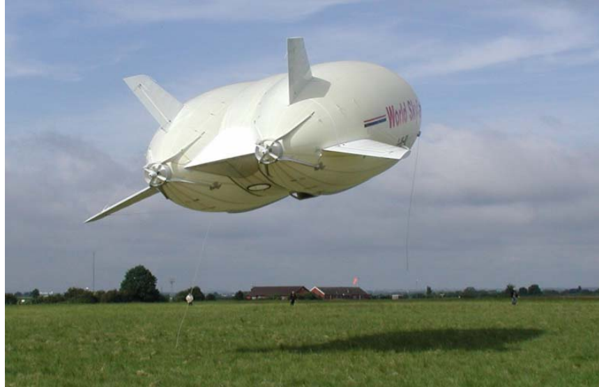
Figure 5. HAV Condor 104