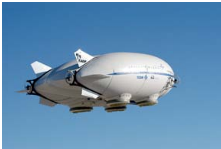
Figure 6. Lockheed Martin P-791