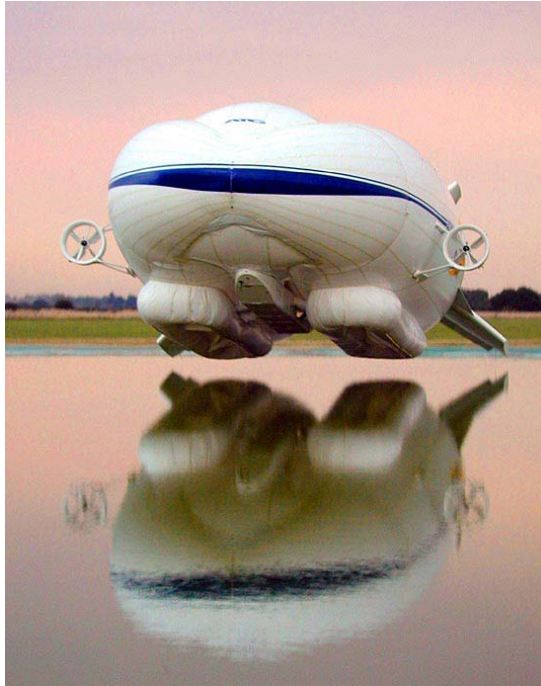
Figure 3. HAV Skykitten