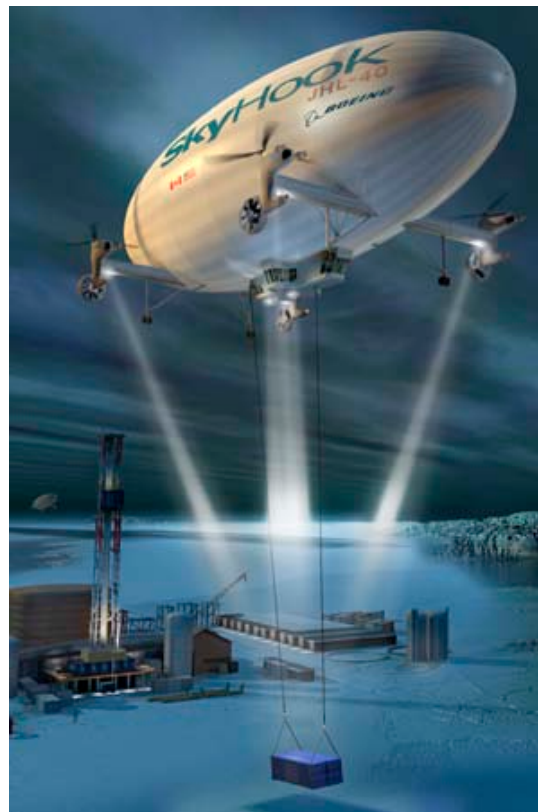
Figure 2. Skyhook HLV Concept