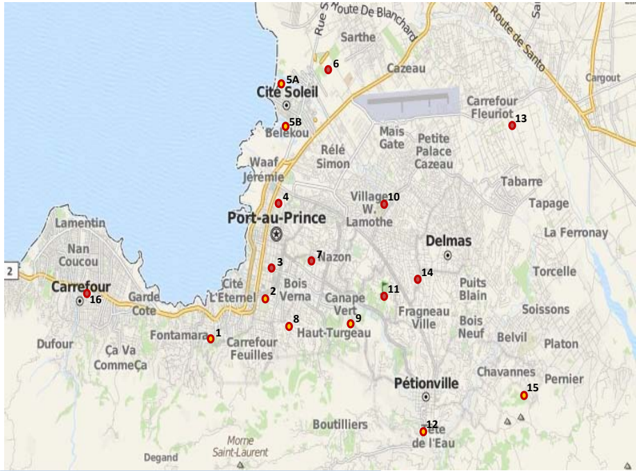
Figure 14. Potential HA Resupply Points in Haiti