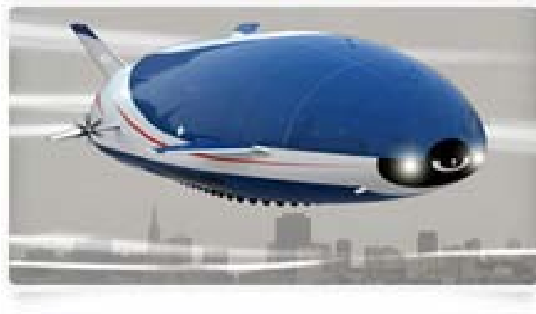
Figure 1. Aeroscraft ML 866 Concept