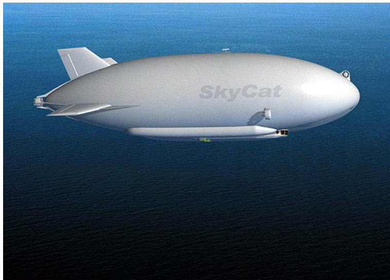
Figure 4. HAV Sky Cat 20 Concept