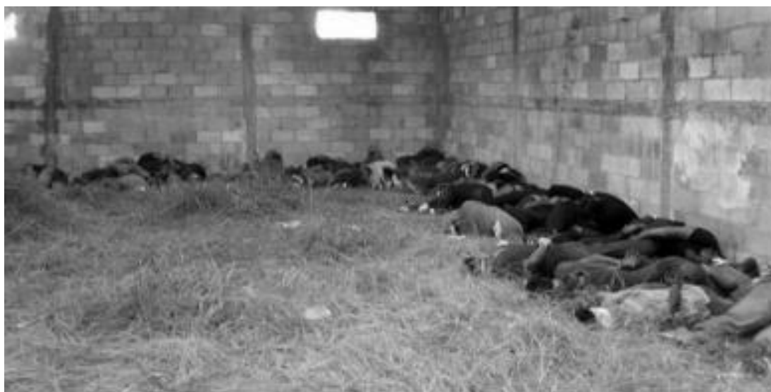
Figure 3: A photo of 72 people from Central and South America who were massacred by Los Zetas near the Texas border. 48

The Mexican states across the border from Texas, New Mexico, and Arizona have been home to some of the worst violence of any parts of Mexico. Recently, members of the Mexican military discovered 72 bodies of men and women 15 miles outside of San Fernando, Tamaulipas state. 47