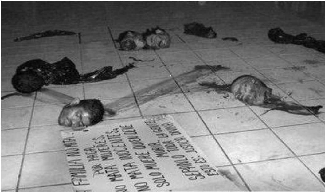
Figure 2: Picture of Sept 2006 Disco Beheadings with a piece of cardboard that states the following: “The family doesn’t kill for money. It doesn’t kill women. It doesn’t kill innocent people, only those who deserve to die. Know that this is divine justice”. 14

The home territory of the LFM organization is Michoacán, as their name implies. The name Michoacán is from Nahuatl and means "place of the fishermen," referring to those who fish on Lake Pátzcuaro. 15 This state in southwest Mexico has 135 miles of coast line, great natural harbors and two of the country’s largest rivers that run into the forest-covered highlands in the eastern part of the state. This geography makes this area a natural staging ground for drug trafficking of all types. The state is also strategically located, being only 178 miles from Mexico City and its population of 23,400,000 people. 16 Mexico City is larger than any city in the United States, surpassing the population of the Greater New York City area by over one and a half million people. 17 This close proximity to so many disenfranchised young males helps feed LFM’s requirement for manpower and provide for an endless labor base.