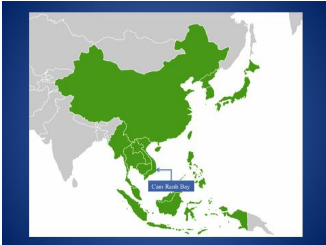
Map 1. (Reprinted from Dr. David Chu Program in Asia Pacific Studies http://www.utoronto.ca/davidchu/undergrad.html )

regional partners such as Japan to return to pre-tsunami strength in order to maintain the balance with China in the Asia Pacific region.