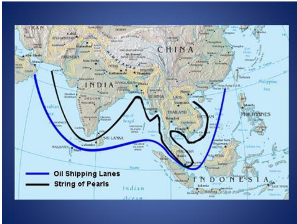
Map 2. (Reprinted from Devonshire-Ellis, Chris. "China's String of Pearls Strategy." China Briefing, 18 March 2009. http://china-briefing.com/ (accessed 20 March 2011).

It could be argued that the risk of upsetting the balance between the United States and China is too high. As China's power grows both economically and militarily, it has taken steps to expand its influence outside its borders. Vietnam is on China's