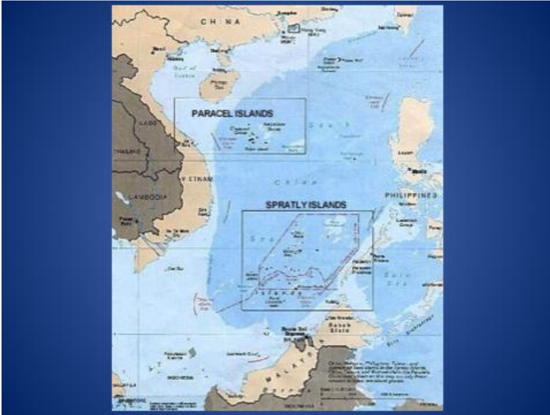
Map 3. (Reprinted from “Boundary Claims in Spratly Islands 1988,” http://www.spratlys.org/maps/3.htm (accessed 20 April 2011).

Vietnamese government. This concern may lead to the same type of resistance that the United States faced in Japan in 2008 when the nuclear powered USS George Washington (CVN-73) replaced the conventional powered aircraft carrier USS Kitty Hawk (CV-63). Popular concerns about nuclear power continue to grow as the recent earthquake off the coast of Japan has caused a heightened international awareness of the dangers that nuclear energy may pose. With reactors critically damaged from the quake, tsunami, and ensuing aftershocks, radiation leaks from the Fukushima Dai-Ichi nuclear power station have the Japanese government scrambling to contain them. 21 This recent event is most likely receiving critical scrutiny from the Vietnamese government since it has expressed interest in developing nuclear power for peaceful purposes. However, the U.S. Vietnamese relationship is still in its infancy, and has far to go to build the type of trust it