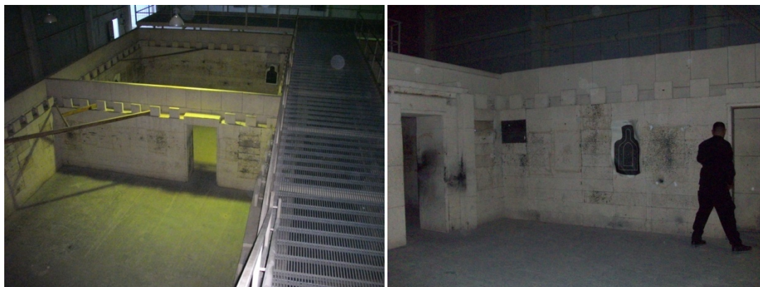
Figure 5—Shoot House Overhead View and Interior Room

The Shoot House is an indoor firing range built at a cost of $2.5 million that allows the ISOF to train in a variety of scenarios. It can be used for live-fire and building-clearing exercises to include the actual “breaching” or entering of the building using explosives, and to allow ISOF soldiers to practice clearing a building using live ammunition. The configuration of the rooms can be modified by closing off some rooms and opening others using special sliding doors. It also permits ISOF soldiers to practice negotiating hallways and stairways; traditionally considered to be danger areas. The Shoot House is shown in Figure 5.